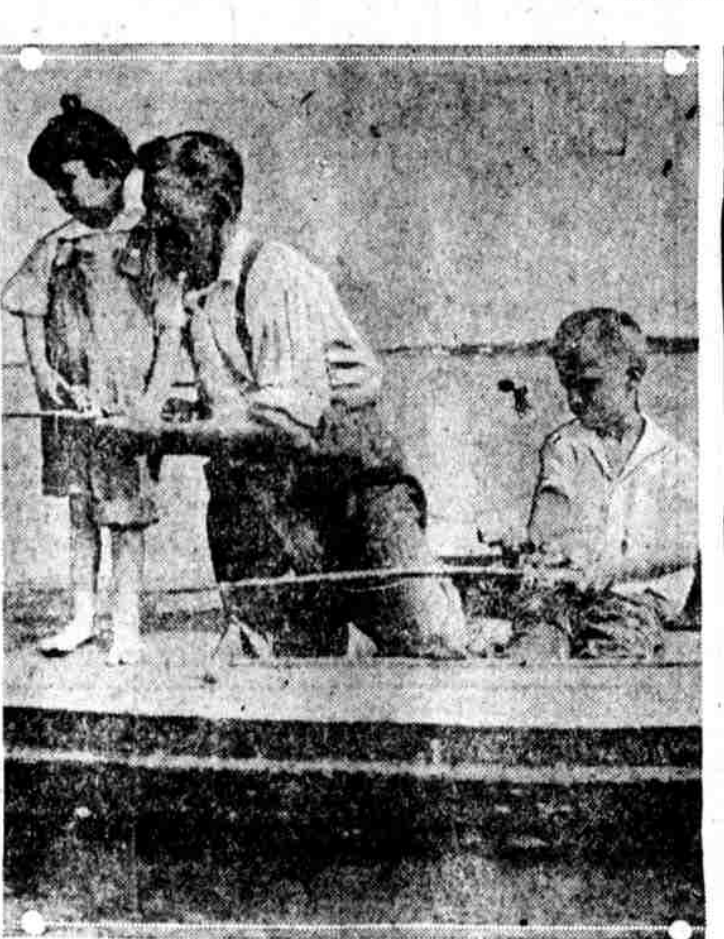
FISHING WITH "GRANDDADDY." The photograph was taken on Barnegat bay, where everybody seems to know something about fishing. The children are getting some real lessons from the experienced fisherman.