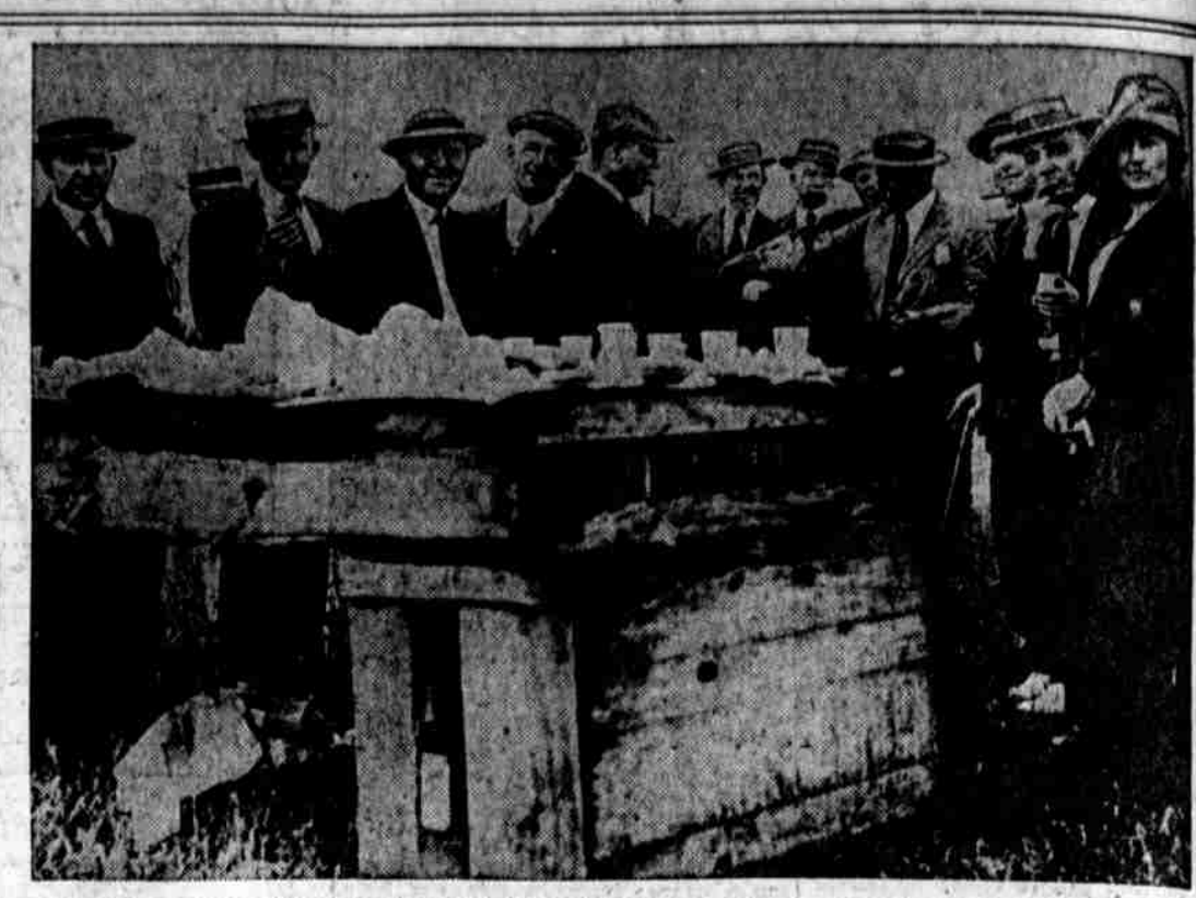
ENTERTAINS NEWSPAPER REPRESENTATIVES. Governor James M. Cox, of Ohio, oversaw the preparing of the meal enjoyed by the scribes on the governor's farm at Jacksonburg, Ohio. The governor is shown in the group chatting with the reporters