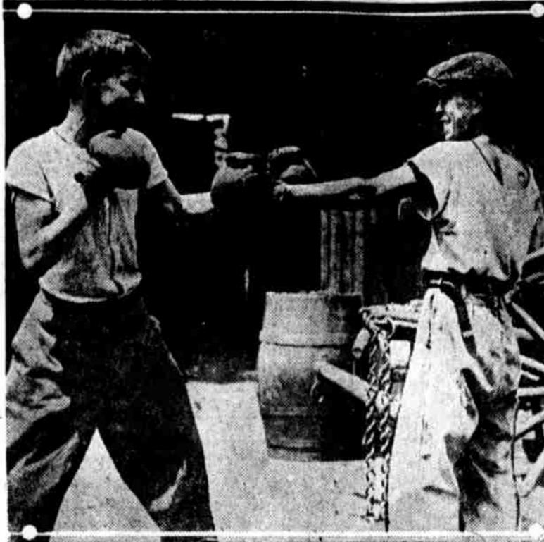
Martins Village is a settlement separated from South Philadelphia by the Baltimore and Ohio Railroad tracks.