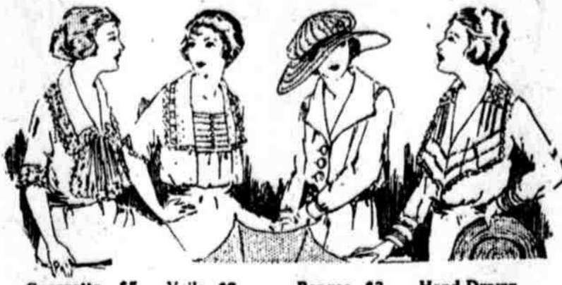
Georgette, $5 Voile, $2 Pongee, $3 Hand-Drawn Voile, $3

And mostly white or the exquisite pale pink that shares Summer's favor with white. Here and there is a beaded waist—but it's the lace-trimmed models that are Fashion's darlings this summer!