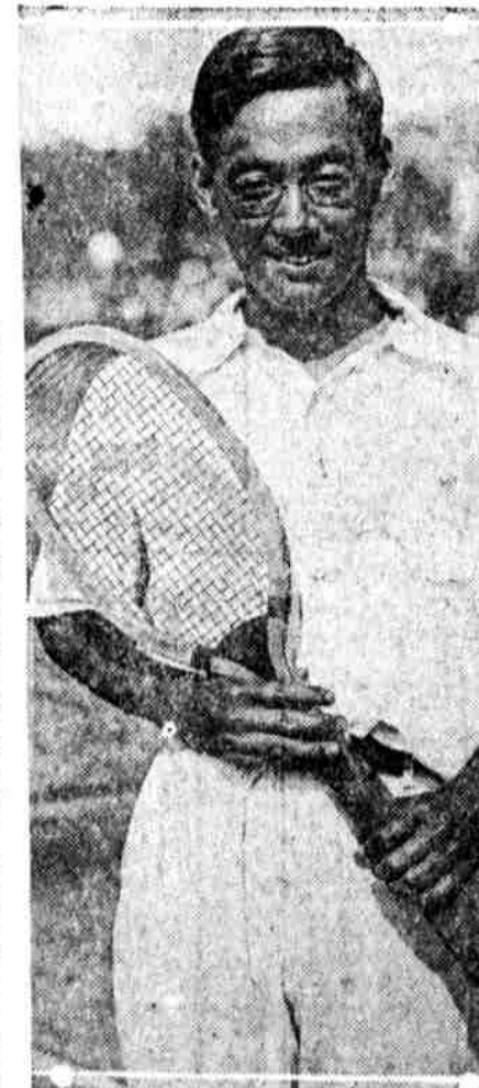
ICHIYA KUMAGAE, the Jap tennis wonder, who has won the Metropolitan single championship of New York.