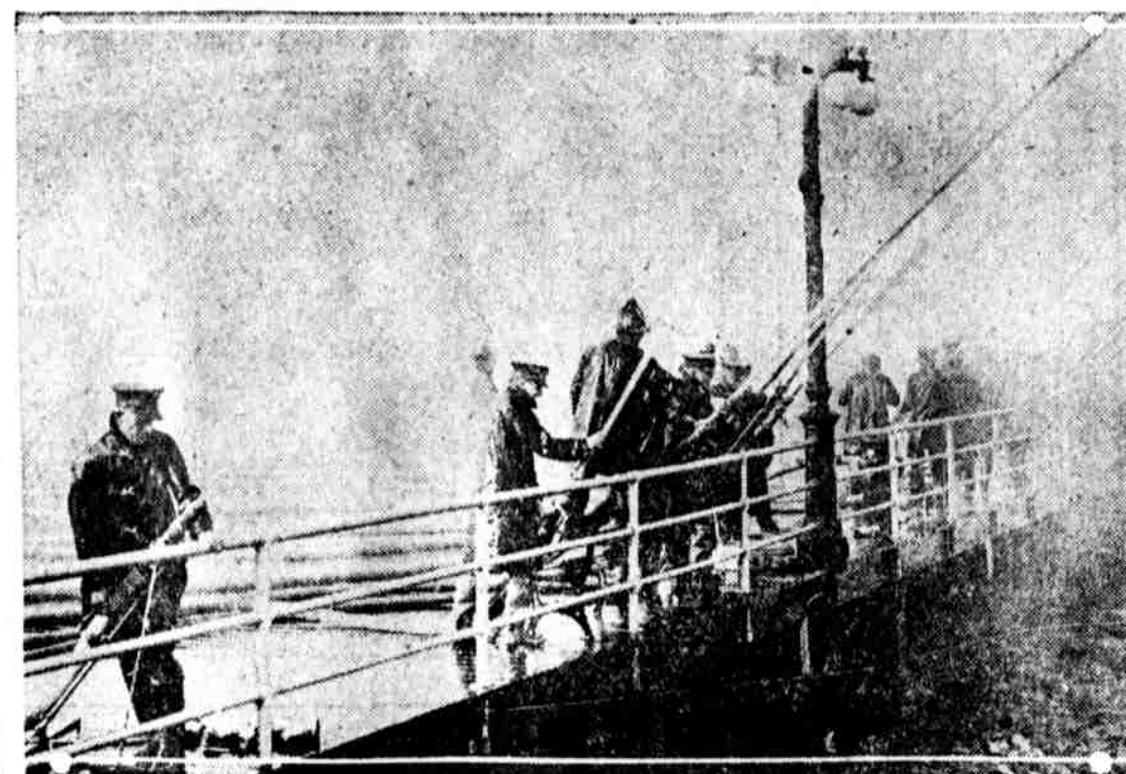
FIRE HOSE TEST. The Atlantic City firemen give the visitors a free show by testing a score of lines on the Boardwalk.