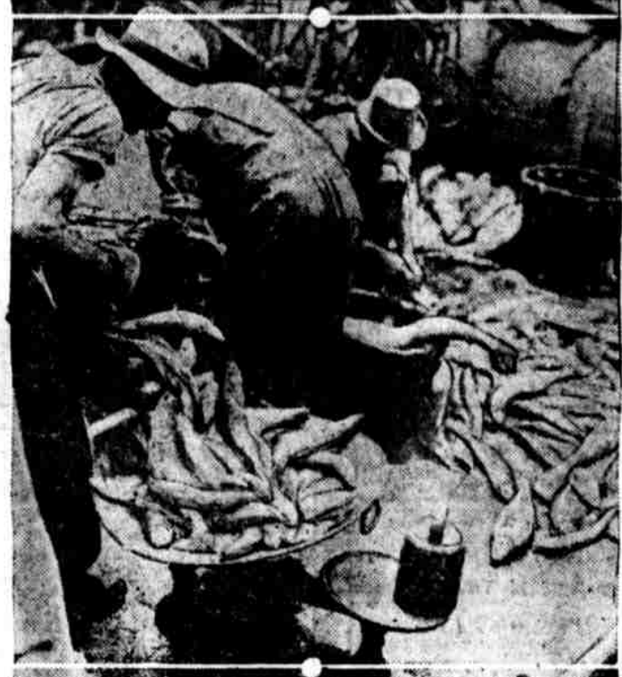
WEIGHING AND CUTTING FISH on a fishing smack at Pier 16, South Wharves. The ship arrived early yesterday morning with more than fifty barrels of choice sea food.