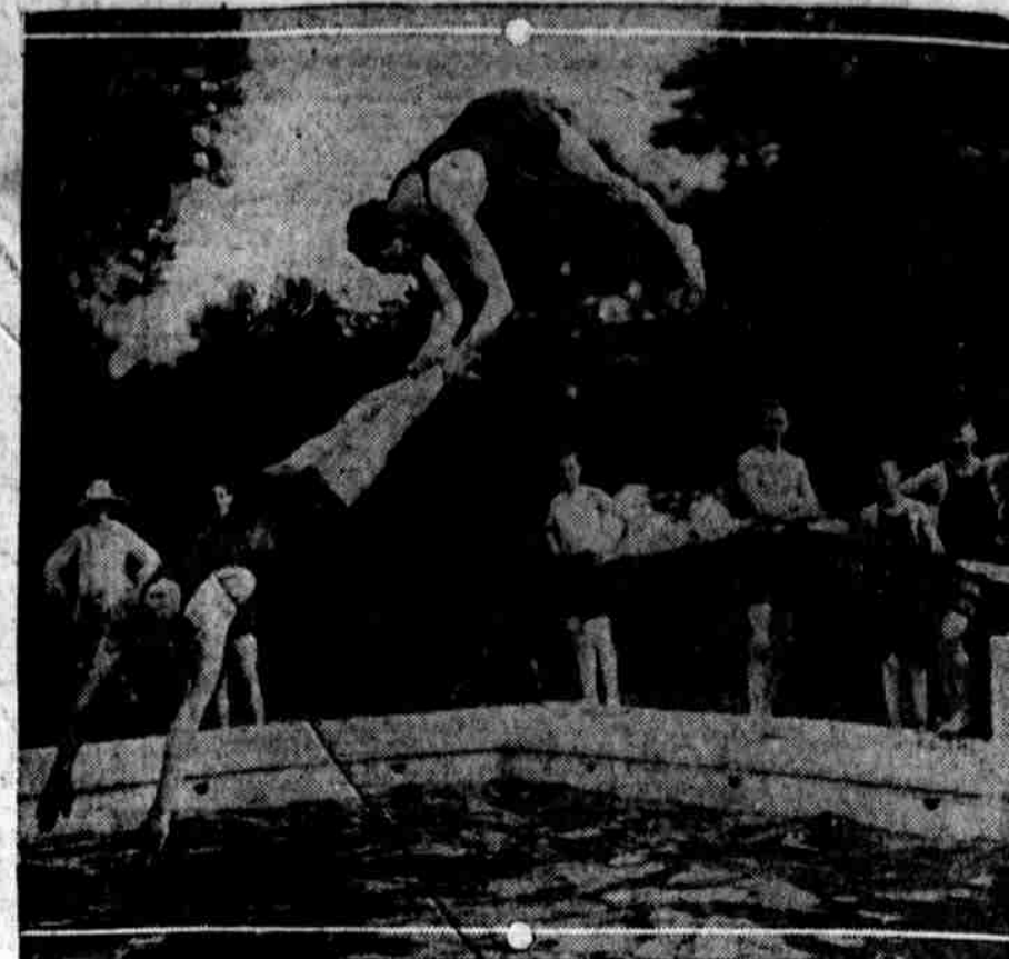
DOUBLE DIVE. Two swimmers of the Curtis Country Club swimming team give diving exhibition. Both divers disappear in the water before the second man lets go.