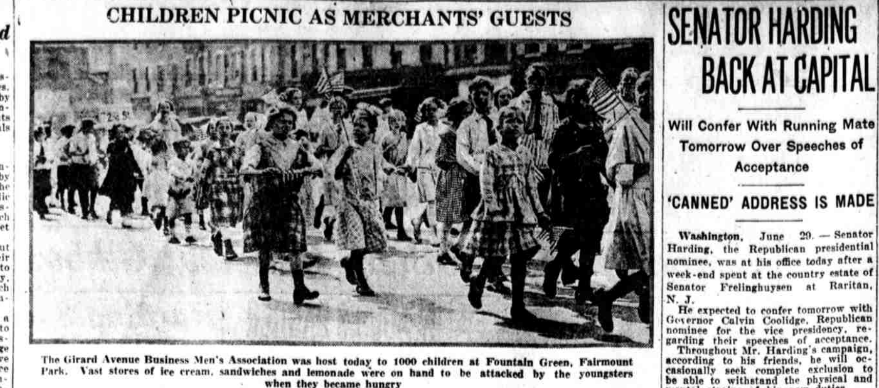
The Girard Avenue Business Men's Association was host today to 1000 children at Fountain Green, Fairmount Park. Vast stores of ice cream, sandwiches and lemonade were on hand to be attacked by the youngsters when they became hungry

thwaite, 6-2, 6-1. GERMAN SHIP CHIEF IN N. Y