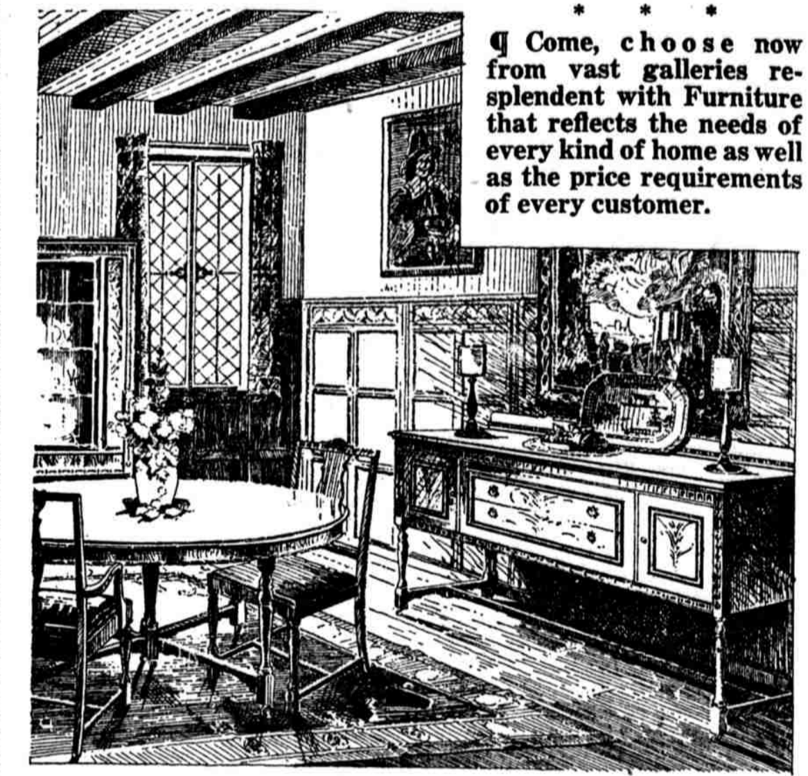
THIS CHARMING MAHOGANY SUITE, TEN PIECES, $520.00 The Suite illustrated is an interpretation of the pleasing effect obtained by employing the design of Furniture that was in vogue in England following the Jacobean Period. The cruder details of that day have been refined to harmonize with the requirements of the superior Mahogany Cabinet woods so admirably utilized in the manufacture of this Suite, which retains the quaintness of the earlier Period while reflecting the artistic treatment of the present time. The skillful execution of the enriched moldings delightfully enhance the plain surfaces of the well-figured Mahogany and impart to the Suite a charm and elegance that make it as desirable for its construction and style as it is exceptionally attractive in price. Note the large Buffet, top 66x22 inches. China Closet 66x22 inches. Table has 8-foot extension.

We make cash registers for every line of business NATIONAL CASH REGISTER CO.