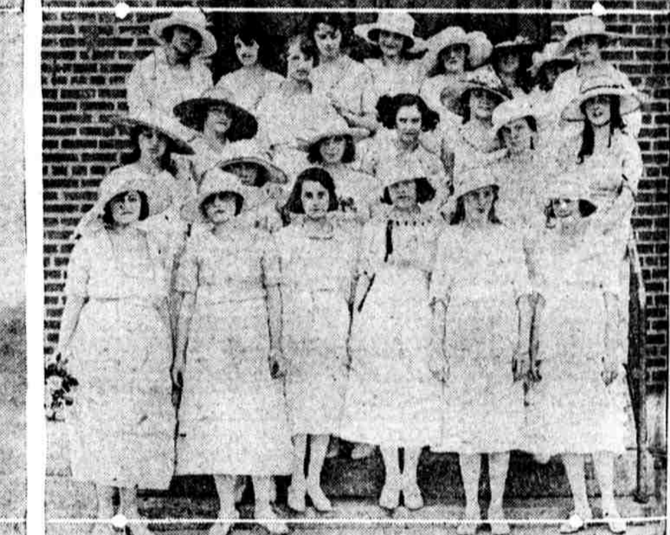
ONE OF THE GRADUATING CLASSES of the Holmes Junior High School, Fifty-fifth and Chestnut streets, wearing commencement day clothing made by themselves