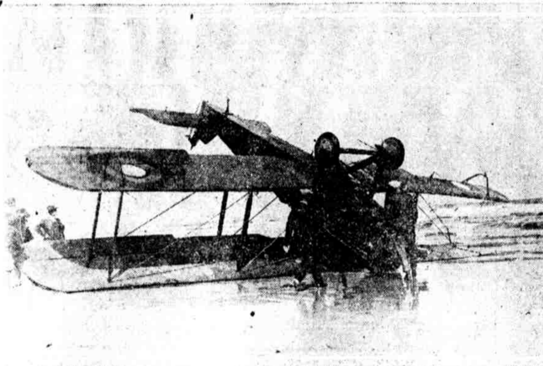
AIRPLANE LANDS UPSIDE DOWN. An army officer on coast patrol was flying over Cape May, N. J., when he was forced to try a landing. The wind played a trick on him and the machine fell to the water's edge. The pilot escaped injury.