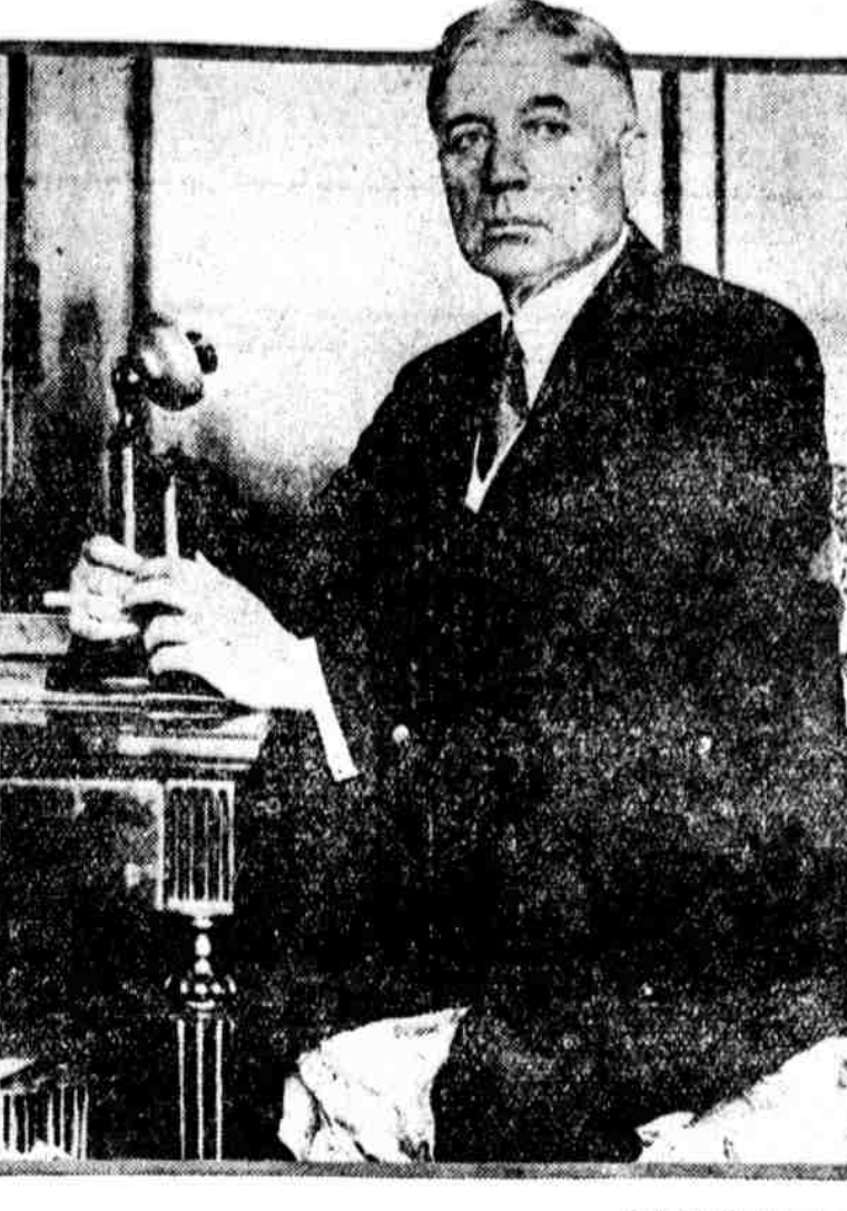
Governor Frank O. Lowden, of Illinois, was photographed by an Evening Public Ledger photographer at his desk in the Blackstone Hotel, Chicago.

It is from this desk he is assisting very much in directing his campaign for the Republican presidential nomination