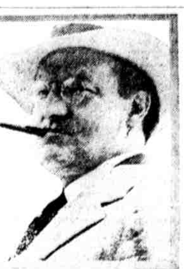
SENATOR JAMES E. WATSON Of Indiana, chairman of the Republican convention resolutions committee

The recent decision of the Supreme Court, he added, "on the Volstead act makes it a legislative issue, and hence it will be up to each Congress to determine what is and what is not an intoxicant."