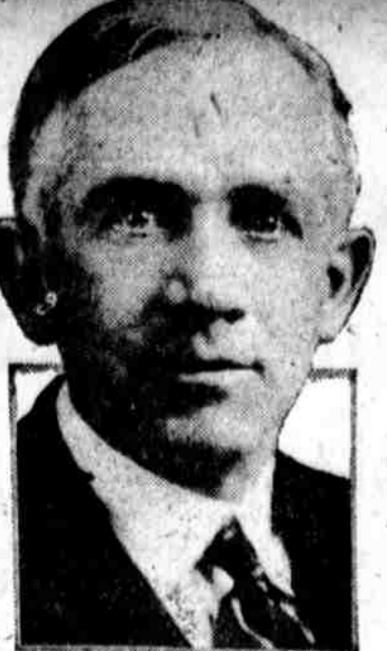
NORMAN H. DAVIS

Assistant secretary of the treasury, who it is expected will be appointed as under secretary of state to succeed Frank L. Polk, who has resigned, to take effect on June 15.