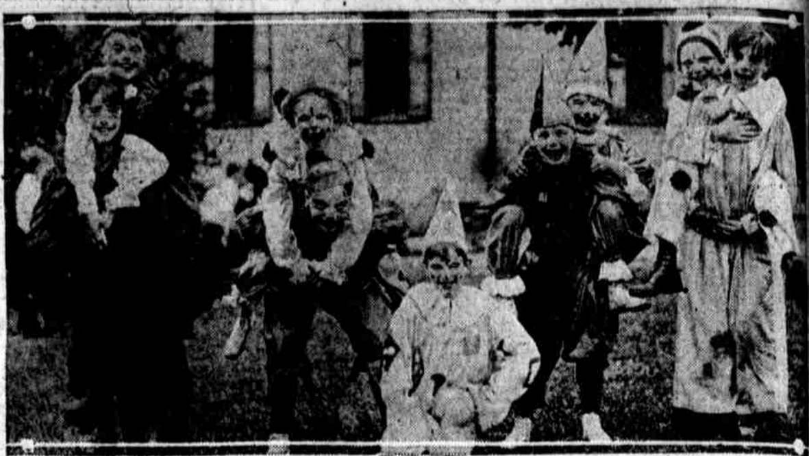
THE CLOWNS were a busy and happy lot at the Abington Friends School lawn party, yesterday. Of course they were willing to pose ...