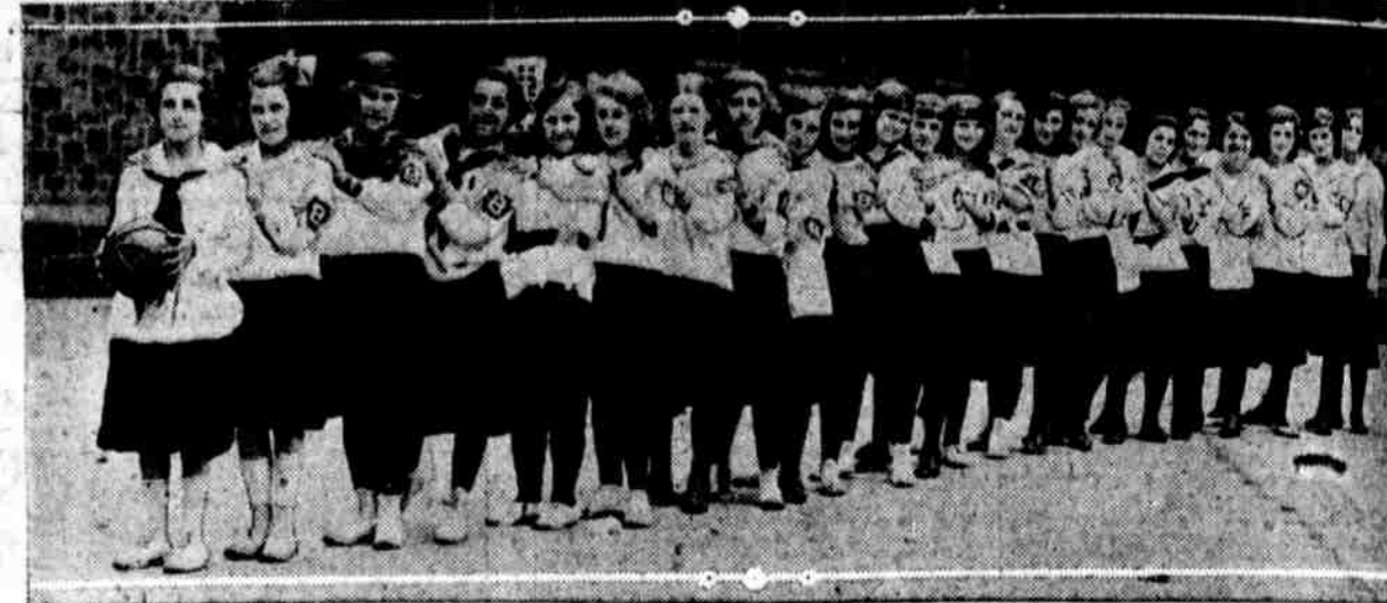
GIRLS OF THE BLAINE SCHOOL, Thirtieth and Norris streets, drill in the school yard. The marching is done to the strains of music from a talking machine