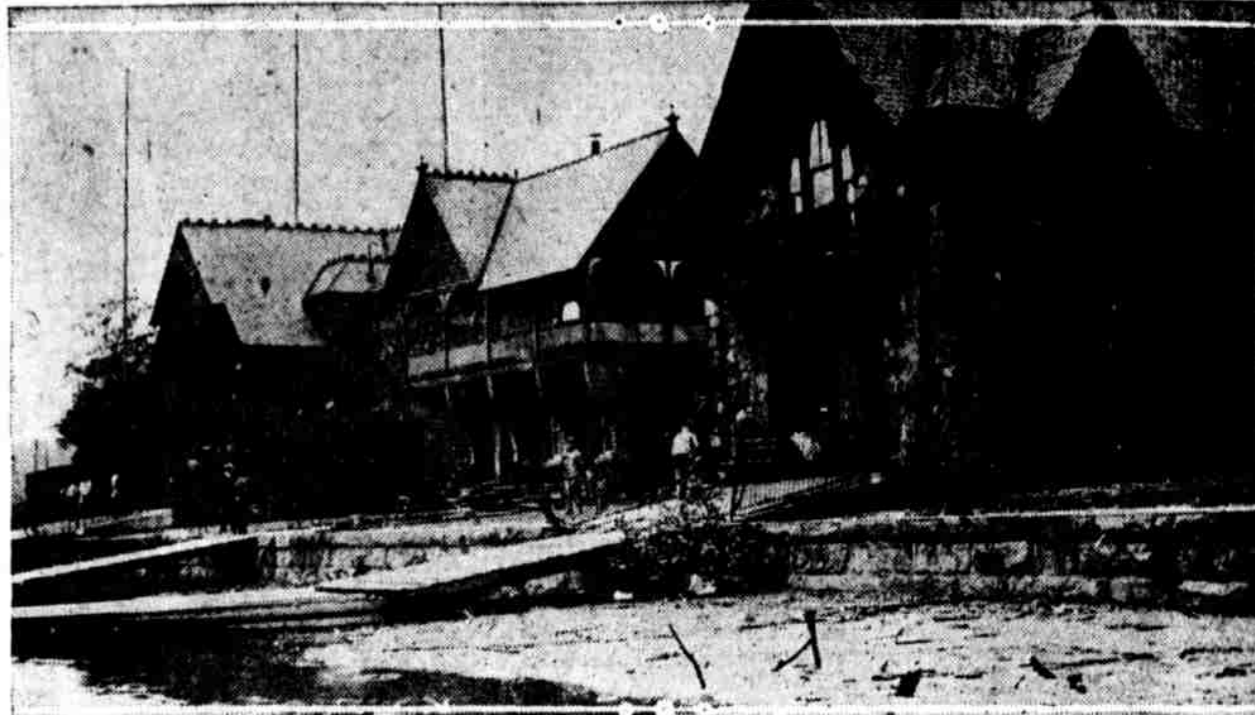
WATER—WATER—SHOUTS BOATHOUSE ROW. The photograph shows how the Schuylkill river has filled up with mud along the river wall in front of the boat clubs. The houses pictured, from right to left, are College Boat Club, West Philadelphia and Undine. Normally the river should reach the wall. Lowering of the dam sixteen inches resulted in the mud flats, which will handicap the oarsmen in the Childs Cup and American Henley regattas this week