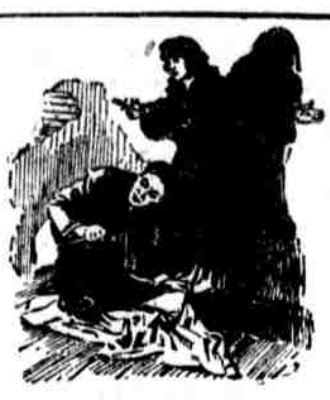
SANANG-SLAYER OF SOULS By ROBERT W. CHAMBERS In Hearst's for June