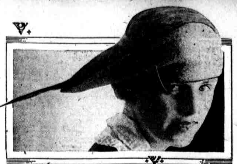
The hat or its wearer? Whatever the answer may be, it's certain that the wearer wouldn't be so pretty without the hat. For the turban is made of soft tan straw in a most becoming shape. The wing that folds over the crown and stands out so importantly from the other side of the brim is harmonious biscuit color. The whole affair is just the thing to wear now when a serge dress or suit is not too warm for street wear