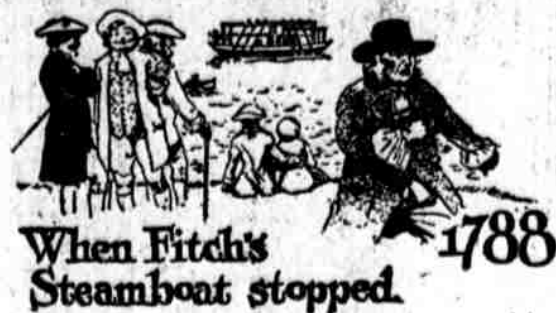
When Fitch's Steamboat stopped.

THE MACMILLAN COMPANY Publishers NEW YORK