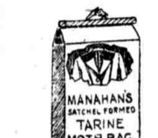
Manahan's Tar Moth Bags. Moth, dust and moisture proof, overcoat size, at 95c. Save a third.