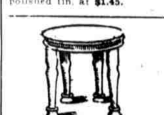
White Enamel Bathroom Stools, strongly made, rubber tipped feet, at $1.95.