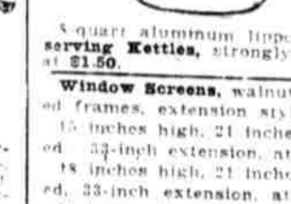
3-quart aluminum tipped Preserving Kettles, strongly made, at $1.50.