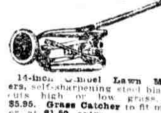
14-inch 2-horsepower Lawn Mowers, self-sharpening steel blades, high or low grass, at $5.95. Grass Catcher to fit mower, at $1.50, extra.