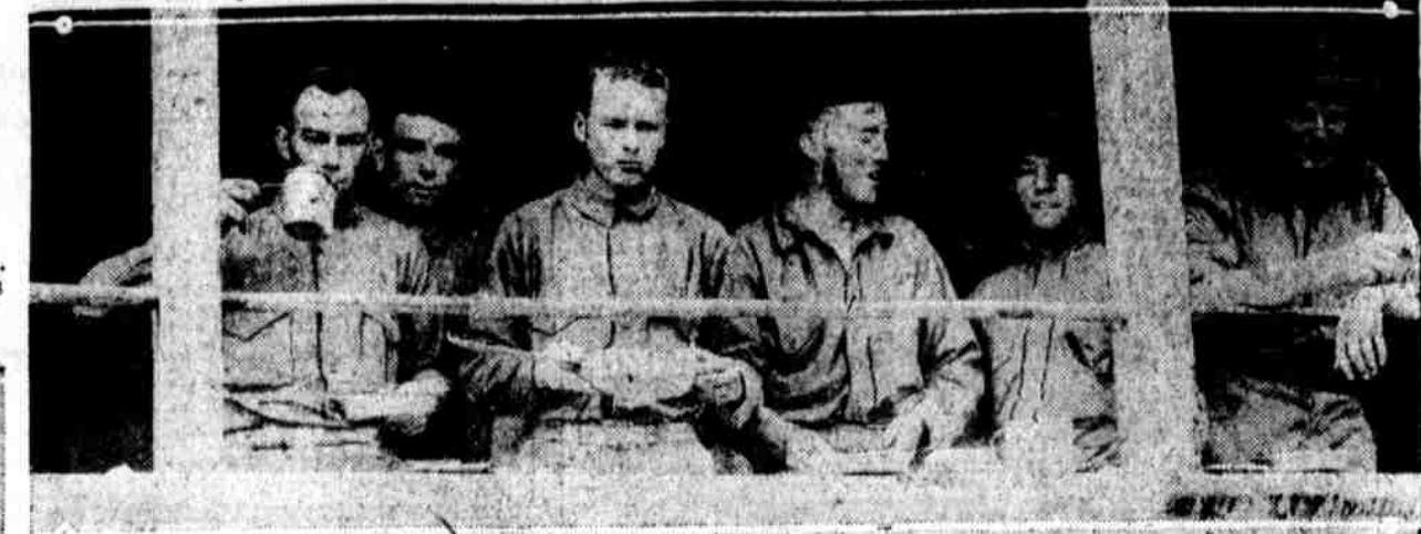
THE LAST BREAKFAST in Philadelphia for a little while for the marines that went away on the transport Henderson early yesterday morning.