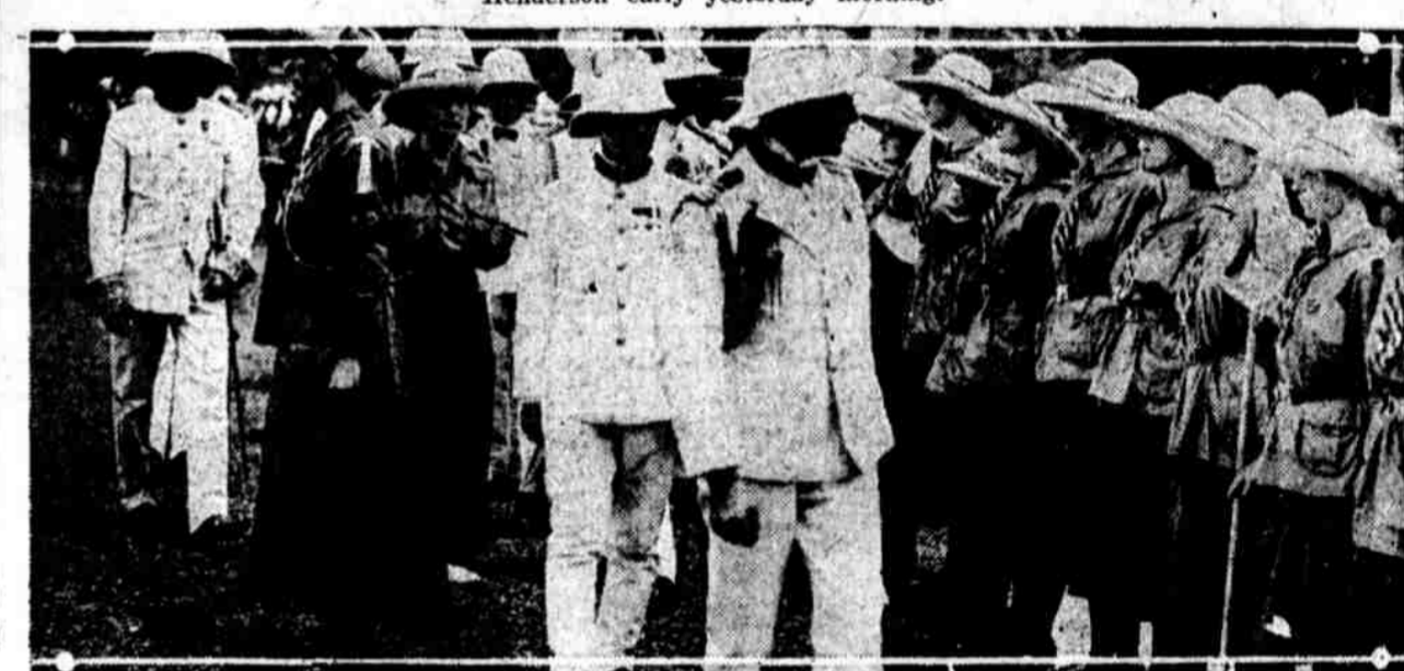
THE PRINCE OF WALES at Barbados, where he is seen making an official inspection of the Girl Guides on the lawn at the Government House.