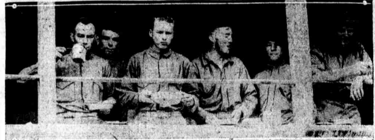
THE LAST BREAKFAST in Philadelphia for a little while for the marines that went away on the transport Henderson early yesterday morning.