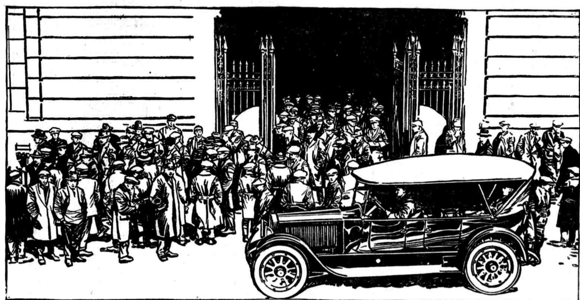
Executives going to a conference in their company's Packard. Hundreds of Corporations have standardized on Packard on an economy basis—high mileage per dollar of investment and low running cost over a term of years

DIRECTOR OF SALES Suite 1101 709 SIXTH AVENUE NEW YORK