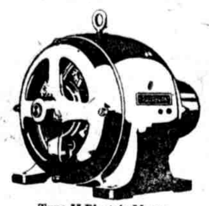
Type H Electric Motor