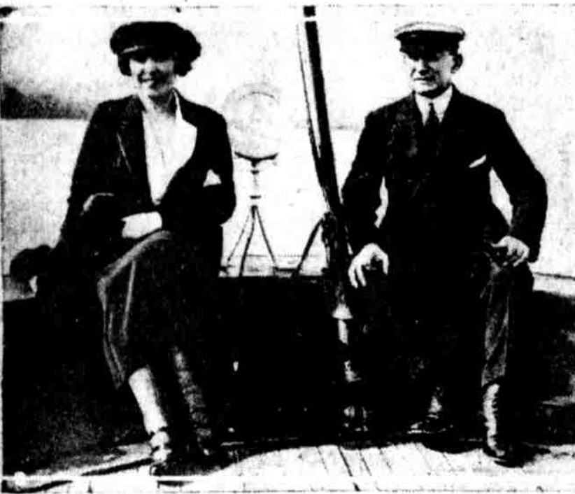
ON A WIRELESS experimental trip, Senator and Lady Marconi have left an English port on their ship, the Electra. The craft is fitted with the latest wireless apparatus