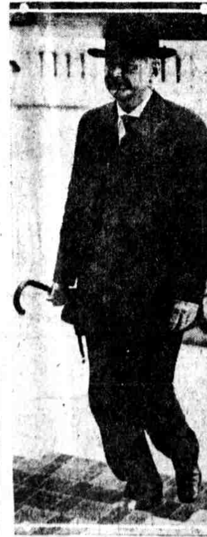
POSTMASTER GENERAL BURLESON has carried an umbrella for thirty-eight years, rain or shine. Mr. Burleson had trouble with his legs. Afraid of being "kidded" if he carried a cane, he chose an umbrella