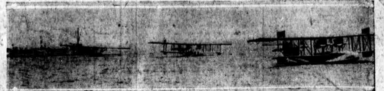
SEAPLANES MAKING UP the Atlantic fleet of the United States Naval Air Service arrived at the Philadelphia Navy Yard during a cruise that started at Norfolk. The craft came from Cape May yesterday.