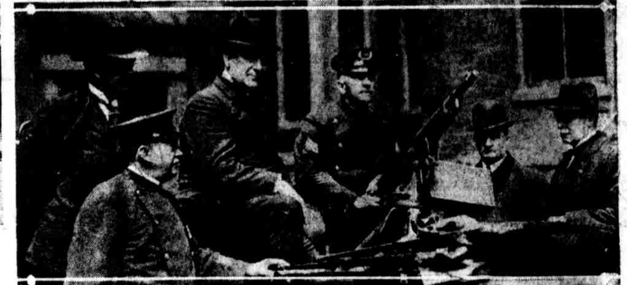
Underwood & Underwood