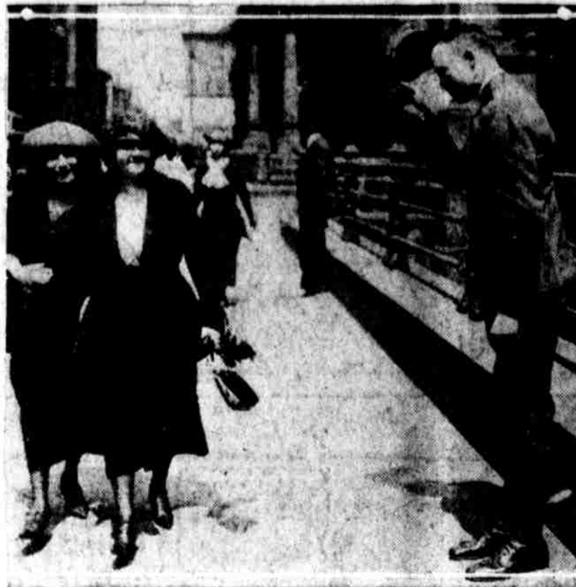
IF A SOLDIER DESIRES to tip his hat to the fair sex, it's proper. Secretary of War Baker recently made the ruling which makes the salute or cap raising optional