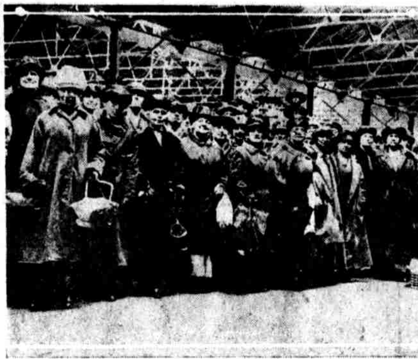
MEMBERS OF the Women's Christian Temperance Union of this country have invaded England. They are telling the English of the work accomplished in the U. S. A.