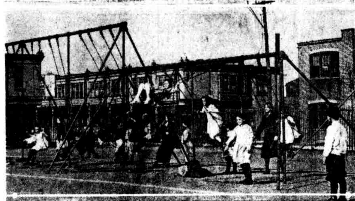
MANY SWINGS in active service at the Vane playground in South Philadelphia. One of the instructors is in the group to see that no harm comes to the children. No limit on high swinging seems to be in effect