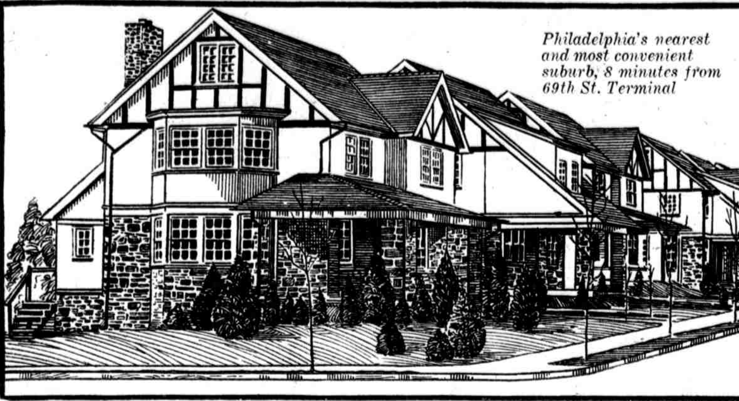
Philadelphia's nearest and most convenient suburb, 8 minutes from 69th St. Terminal