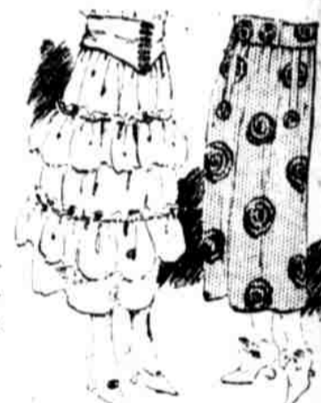
Ruffled Taffeta, Figured Fan-ta-Si Sale-Priced, $16.75

Pleated—Tailored—Tucked—Be-Ruffled—and Novelty Styles —Gimbels, Salons of Dress, Third floor.