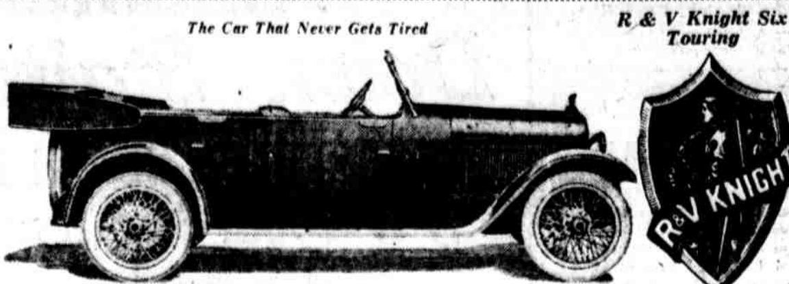
The Car That Never Gets Tired

day efforts were made to get the aged statesman to talk, but all were futile.