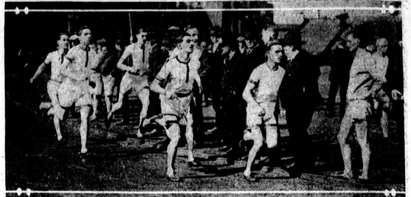
SIX OXFORD-CAMBRIDGE SPEED MEN, who arrived on Saturday from England, were photographed as they sprinted at Franklin Field yesterday afternoon. They express much confidence in their relay team.