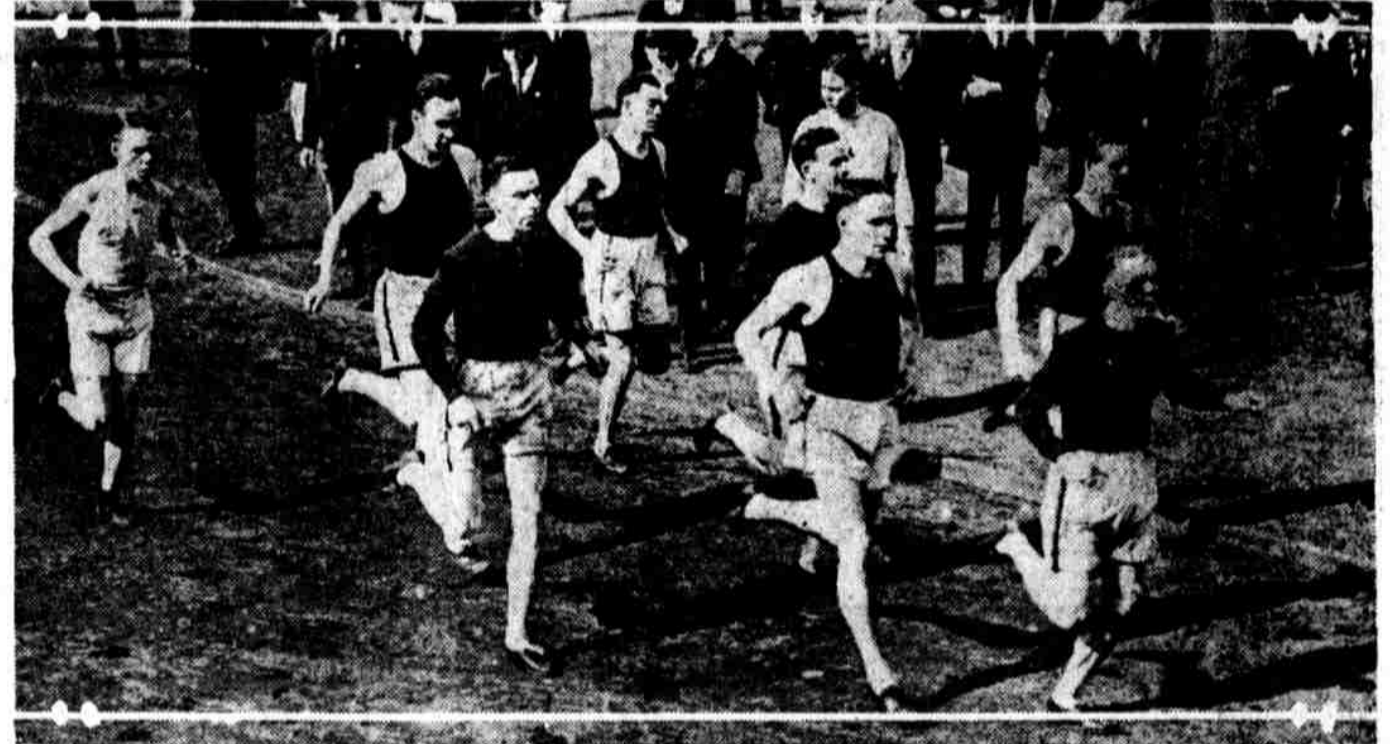
SCORES OF STUDENTS were on Franklin Field yesterday afternoon watching Penn's relay team in their workout. Several private trials will be made during the week. Eight of the picked men can be seen on the cinder path.