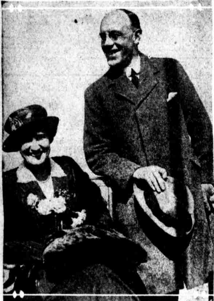
THE NEW BRITISH AMBASSADOR, Sir Auckland Geddes and Lady Geddes, photographed on a coast guard cutter, to which they were transferred from the ship on which they arrived from England yesterday. Lady Geddes once lived on Staten Island, New York.