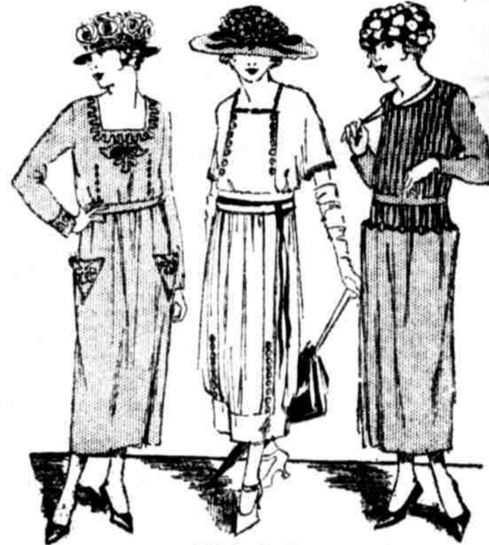
Wool-Jersey Dress Sale-Price $10 Note the "twisk" broom pockets.

in a few styles, the sizes run clear up to 52!