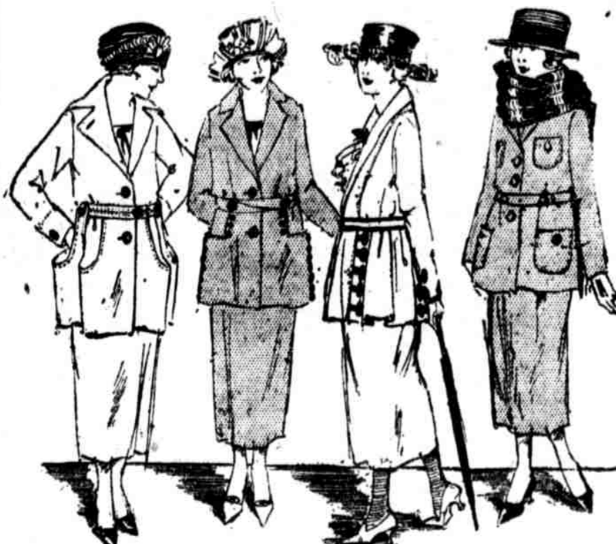
Wool-Jersey Suit In semi-sports effect. Sale-Price $22.75 Note the pocket.