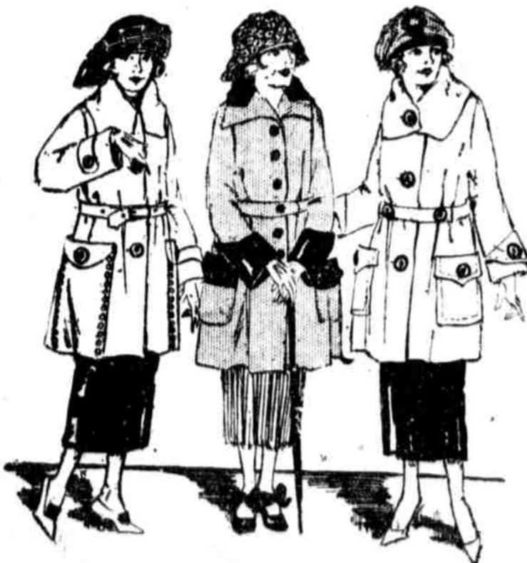
Velour Coat, Sale-Price $16.75 With enormous pocket, etc. and buttons by the dozen.

And those smart brown-and-white and black-and-white tweeds that have the lovely fleck of red and brown and black half-hidden in the mixed effect. Sizes 14 to 18. Women's, 36 to 44. A few styles run up to size 52. —Gimbels, Subway Store