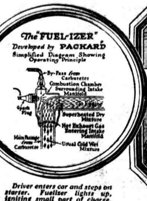
Driver enters car and steps on starter. Fuelizer lights up, igniting small part of charge, which mixes with the main charge on its way to the engine. Motor starts instantly.