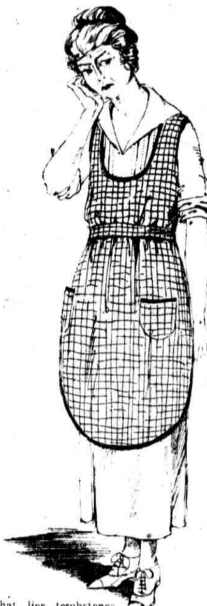
What lies tombstones tell: "Beloved Wife."

No man who ever worked under the comfort of steam heat—or, in summer, sustained by electric fans and ice water; who has derricks to do his lifting and engines to move things, has any moral right to let his women folks be old at forty.