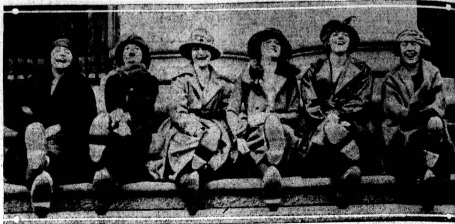
THEY WEAR blue and pink and lavender colored shoes. All made of wood and from Holland. The sextet were out for a little stroll on Chestnut street yesterday, and they visited Independence Hall. Of course, they got tired and were snapped as they rested at the Curtis Building, Sixth and Walnut streets.