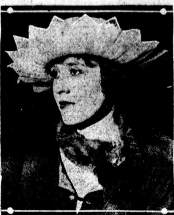
A HAT made of shavings, a new Paris suggestion. So all you have to do now is look for a building operation and collect hat material.