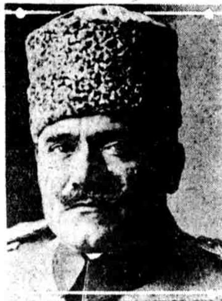
TACHI PASHA, a Turkish leader, whose capture and arrest by General Milne, at the occupation of Constantinople, has been reported.