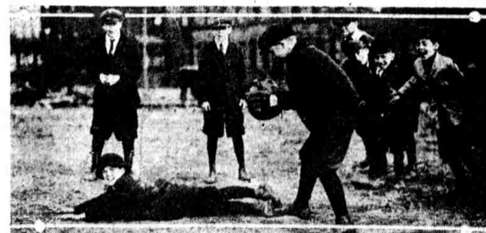
SLIDING INTO SECOND. He made it, too. The ball hit the glove as he hit the rock they called a base. Scene—Moylan Park, Twenty-fifth and Diamond streets.