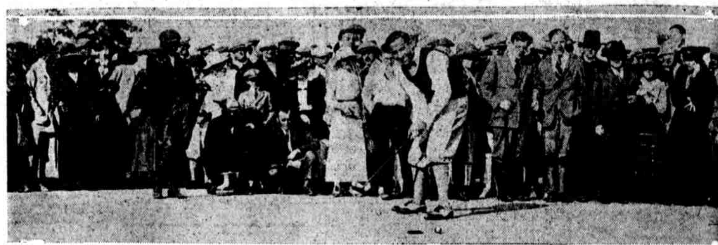
WALTER HAGEN (putting), open golf champion of the United States, laughed when he missed the putt, as seen above, which cost him the north and south championship at Pinehurst last week. The emotional expressions of a golf gallery are well brought out here as they groaned aloud.