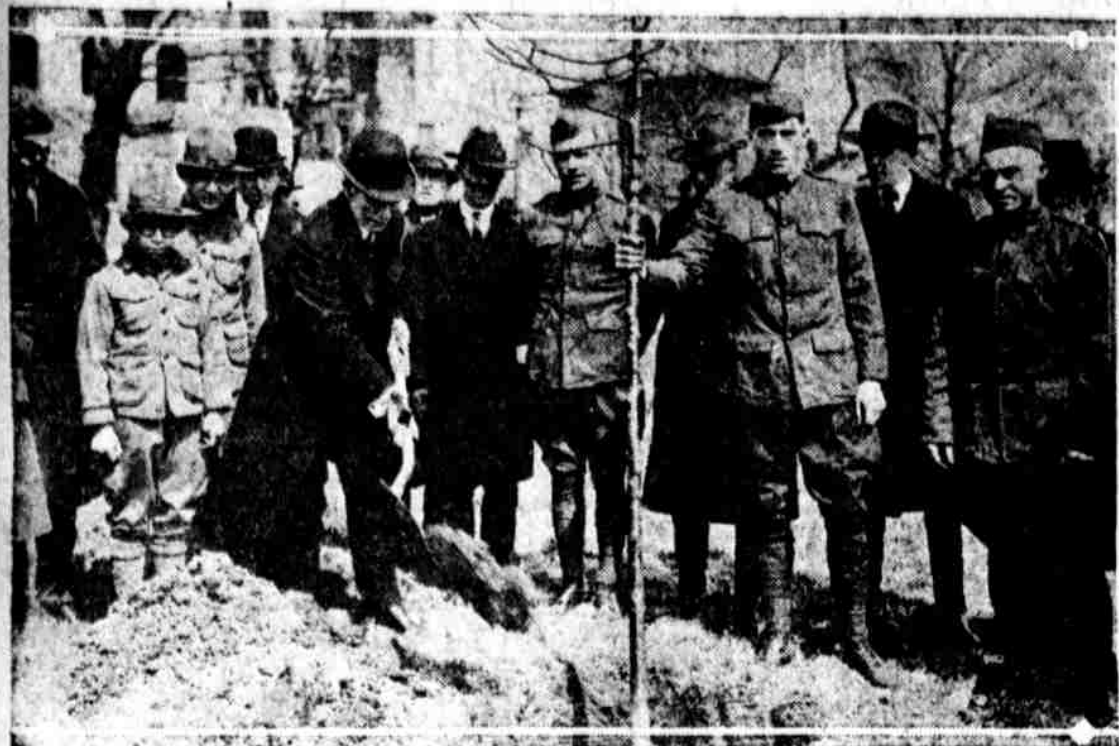
GOVERNOR EDWARDS, of New Jersey, assisting in planting four trees on the New Jersey Capitol grounds, at Trenton yesterday. They are in memory of four members of Company C, 10th Engineers, who died in France.