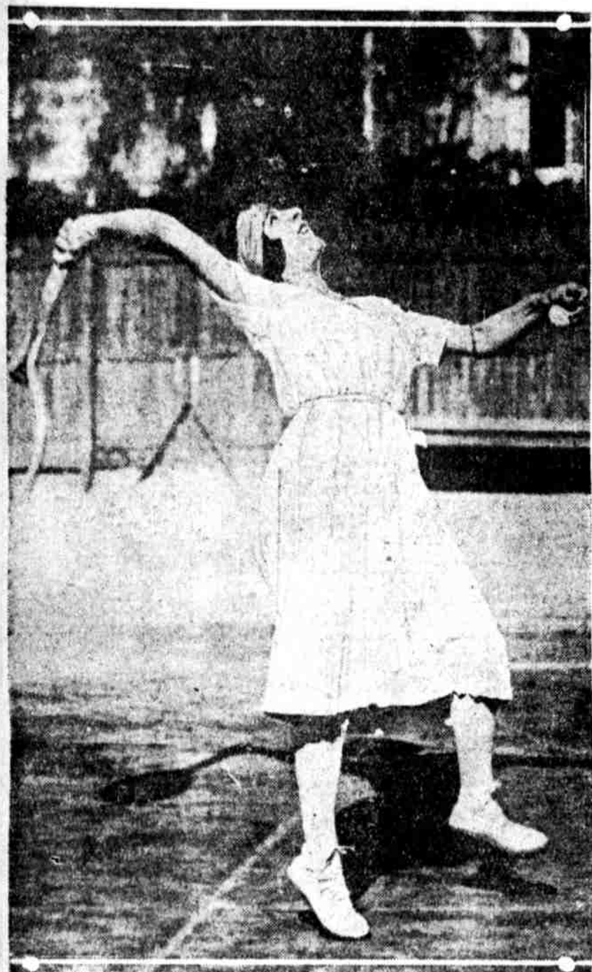
Mlle. SUZANNE LENGLEN, the French tennis star, snapped while practicing at Nice, France. She plans to play American women in this country.