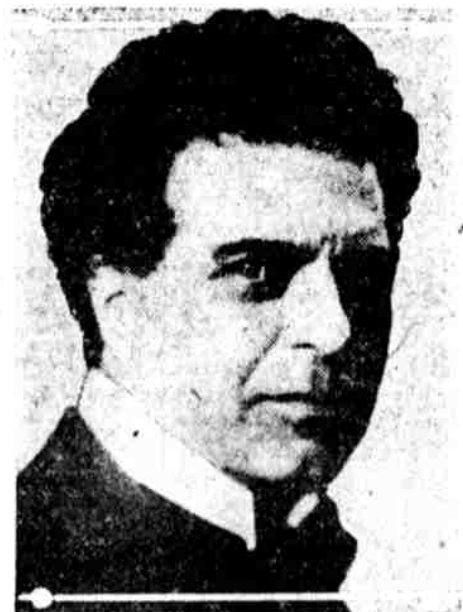
PETRO MASCAGNI, the widely known composer, who may be elected a member of the Italian Senate.