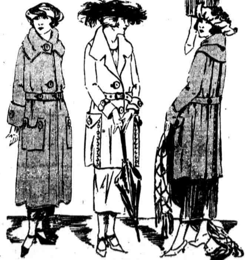
Tweed—with a stunning collar, Double Velour Sports Model, Silvertone Tote-back Model Four of the Fifteen Styles at $19 —Gimbels, Subway Store