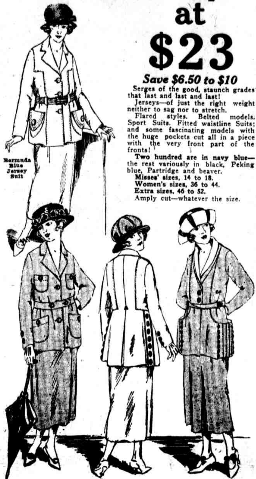
Leather Jersey Sports Suit, Button-Trimmed Serge Suit, Fitted Pocket Jersey Suit Four of the Twenty Styles at $23

Two hundred are in navy blue— the rest variously in black, Peking blue, Partridge and heaver. Misses' sizes, 14 to 18. Women's sizes, 36 to 44. Extra sizes, 46 to 52. Ample cut—whatever the size.