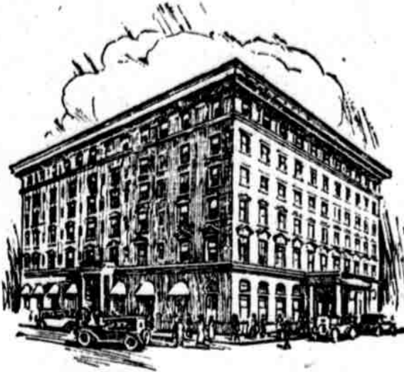
In the Hotel Oliver, South Bend, Indiana, a Sturtevant Turbo-Undergrate Blower, in a special test, raised a 150 horse-power boiler to 309 horse-power. This 206% of increased power was reached on coke breeze.

STURTEVANT Turbo-Undergrate Blowers were designed in accordance with the Sturtevant principle of putting air to work. These compact units are built like every other Sturtevant product—strong, rugged, and capable of doing more work than other makes with the same ratings. During the past sixty years many manufacturers have found that the extra strength and longer life of Sturtevant machinery are a paying investment.