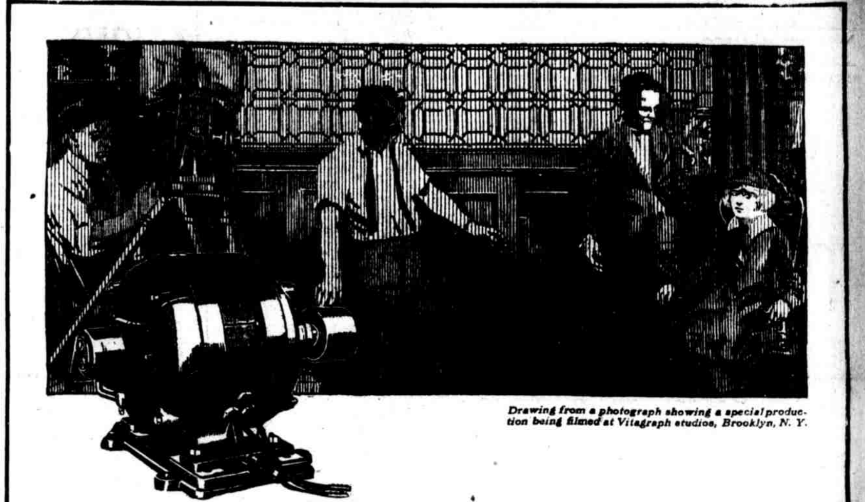
Drawing from a photograph showing a special production being filmed at Vitagraph studios, Brooklyn, N. Y.