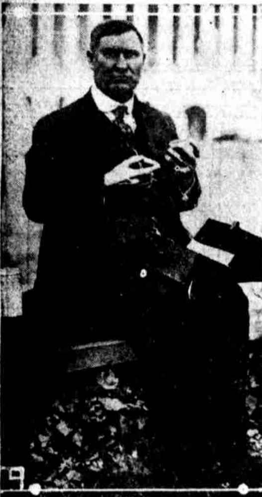
CARRIES HIS LUNCH to the Capitol. He is Representative Percy Edwards Quin, of Mississippi. He was willing to pose with his lunch box.