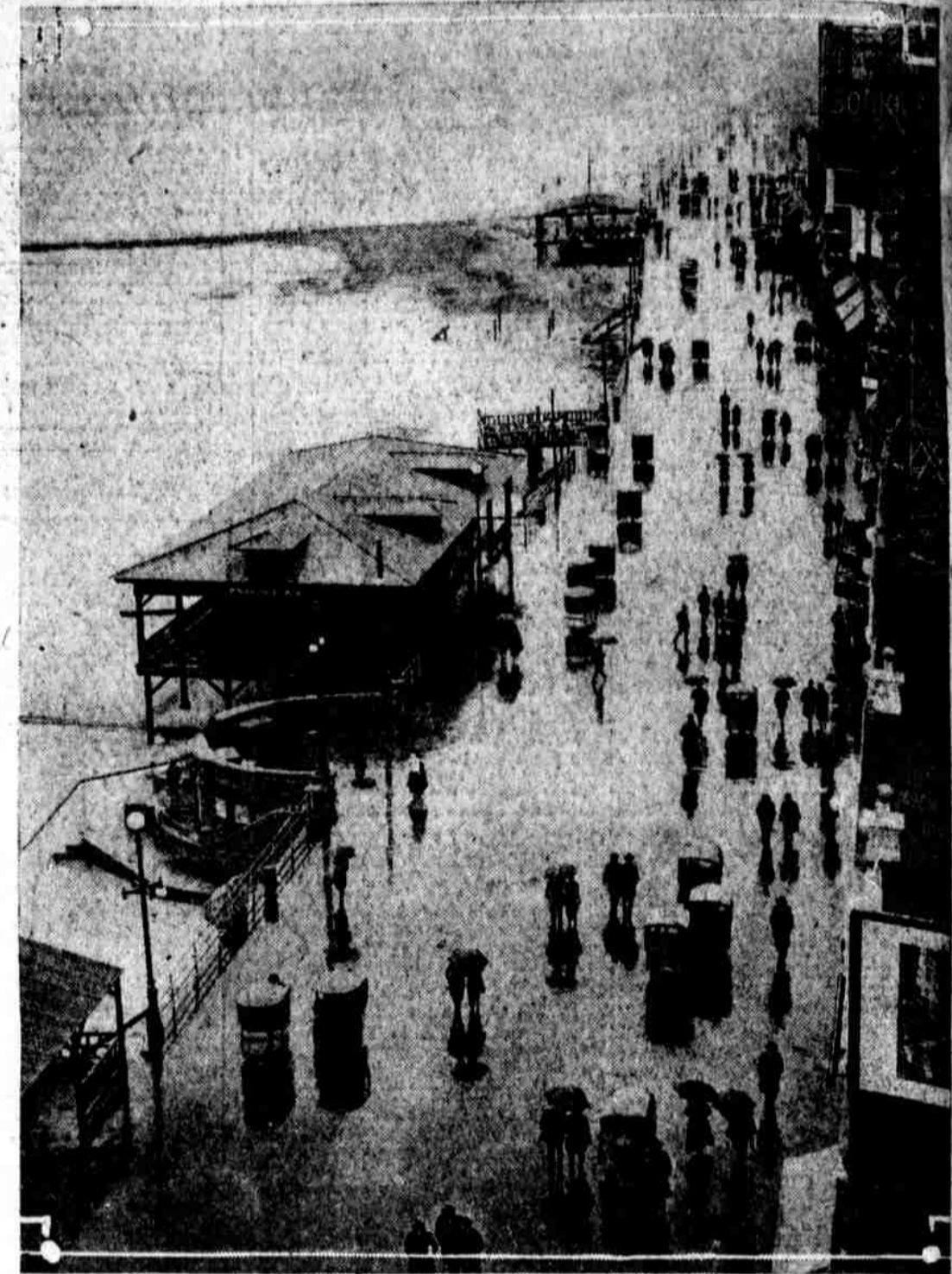
IT STOPPED RAINING yesterday at Atlantic City sometimes, but just enough to get another good start. This photograph was taken in the afternoon from the Alamae Hotel and tells the true story of the 1920 Easter on the Atlantic City boardwalk.