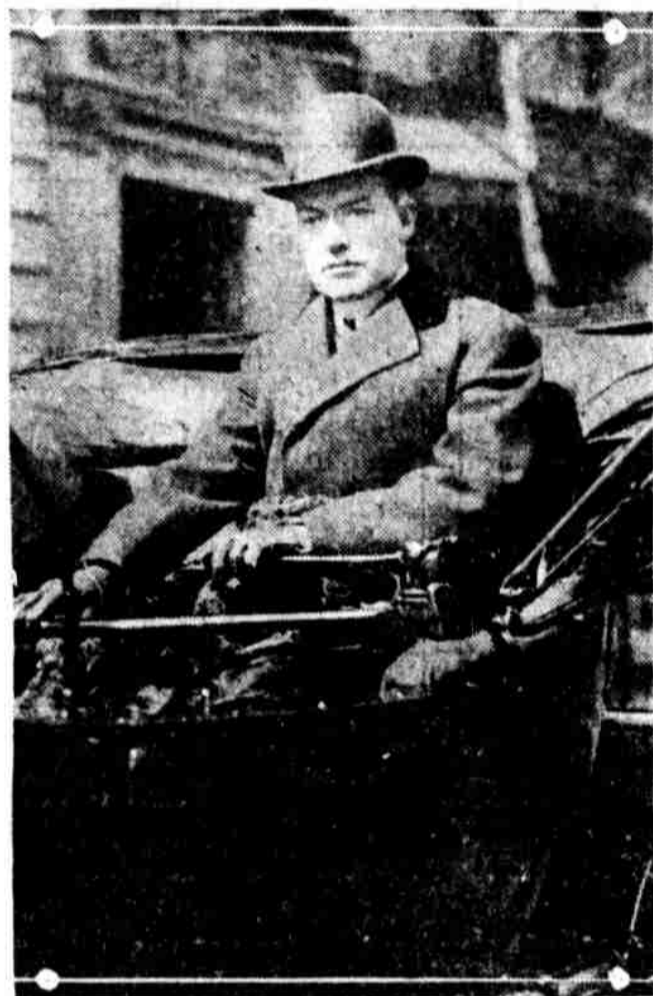
IT'S A QUESTION. Does John D. Rockefeller, Jr., drive an electric because he likes to, or is he one of the many fighting the present high cost of gasoline?