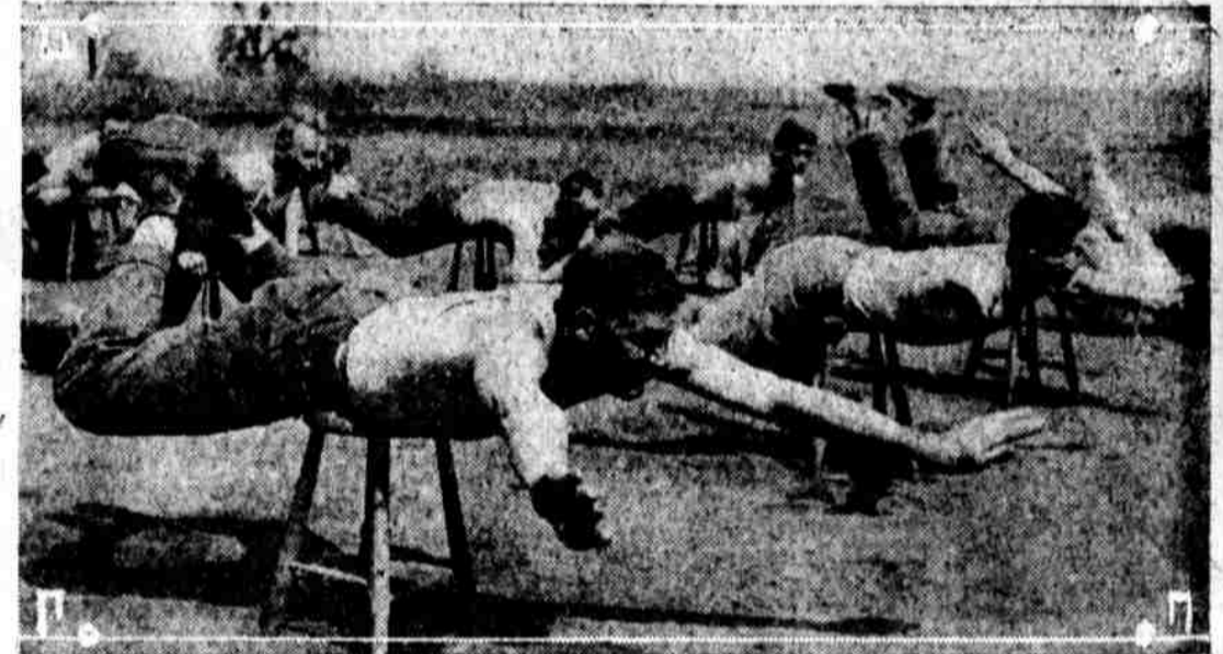
THE WEST POINT class which has just returned from Europe, doing swimming strokes on the camp stools at Camp Benning, Georgia. Under new rules each West Point class must spend one year at this camp.