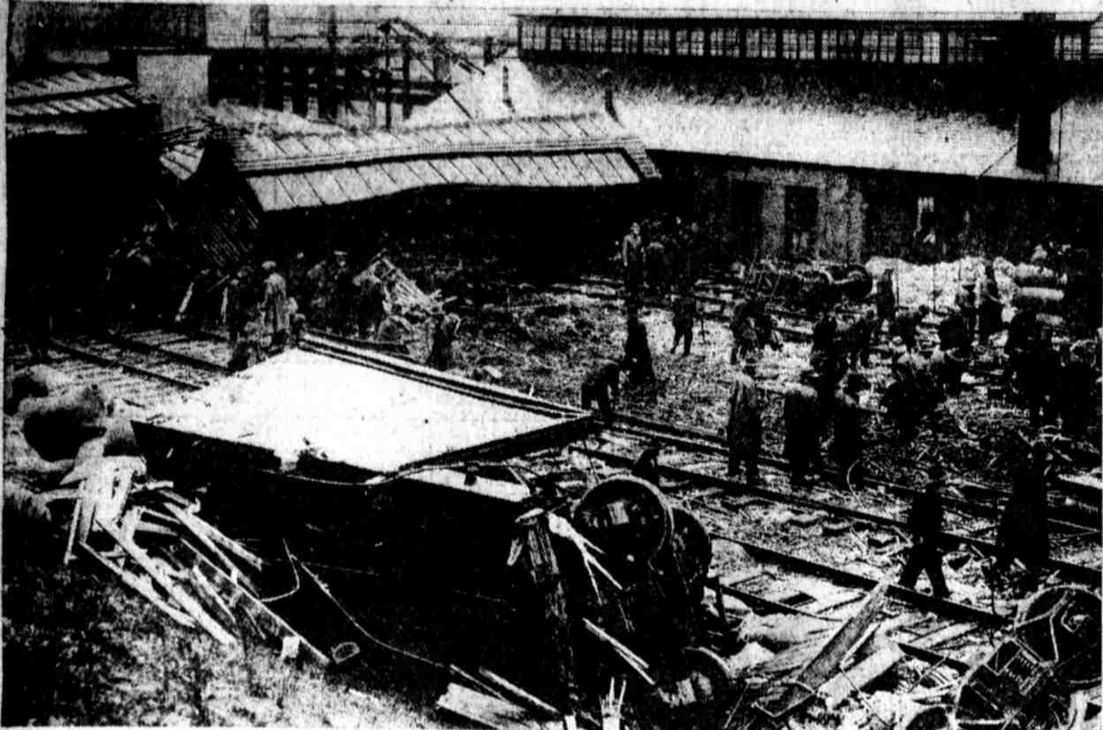
MORE THAN A SCORE of boxcars on eastbound freight No. 267 were wrecked shortly after 1 o'clock this morning a few hundred yards west of the St. Davids station on the Pennsylvania Railroad. Automobiles, toys, dentists' equipment and bales of felt were scattered among the wrecked cars that blocked the four tracks. The photograph shows the general scene of the wreck.