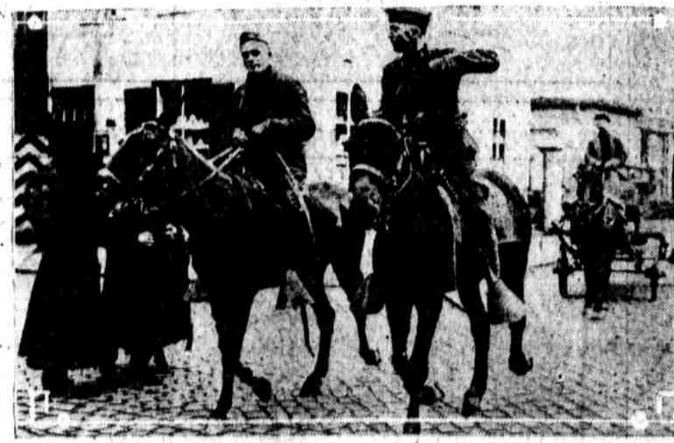
JOY RIDING at Coblenz, Germany, on Missouri mules. American officers like them for week-end trips around Germany.