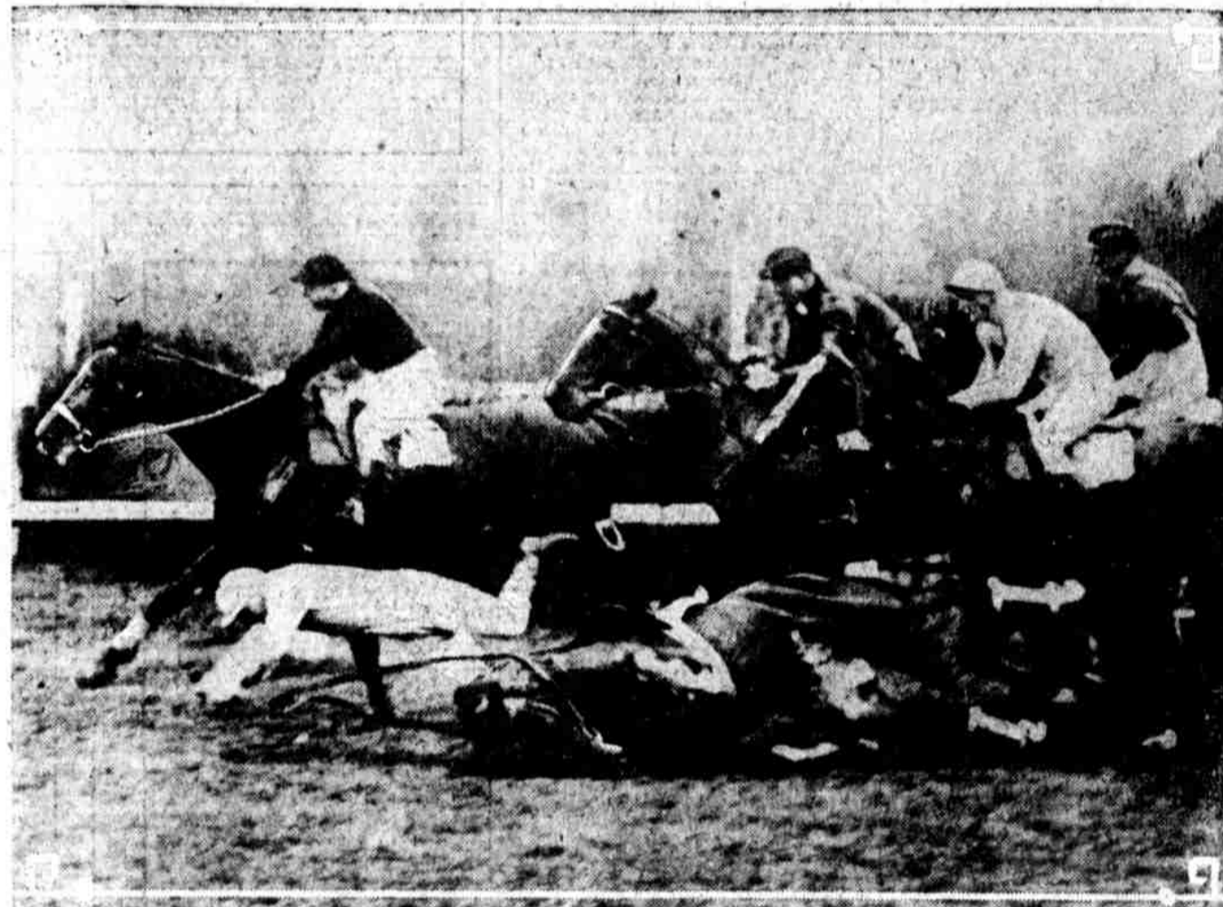
GREENWOOD'S GIRVAN falls in the Palace hurdle handicap at Hurst Park, England. Jockey Dillon is seen taking a "header" in front of the other horses in the close heat. He escaped with a few bruises