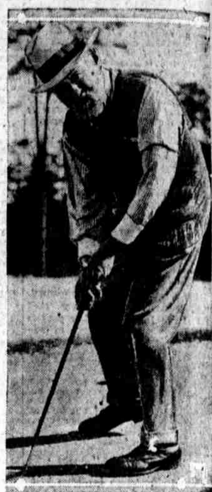
OSCAR STRAUS opposing Mr. Taft in a close golf match on the golf links of the Country Club at Augusta, Ga. In this match Mr. Taft was the winner