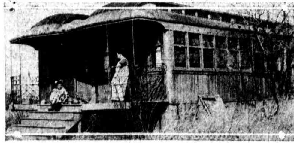
IF YOU CAN'T GET A HOUSE, here's the solution. Flag a train. Take home two coaches. Build them together and there you have a real abode. Passenger coach houses are being used at Staten Island, New York, where they rent for $8 a month