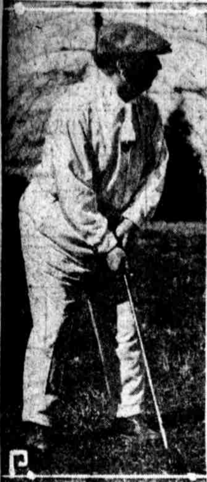
INTRODUCING a well-known golfer. He is William Howard Taft. He was snapped on the Country Club links at Augusta, Ga., while manipulating a mid-iron.