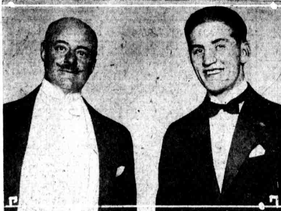
TWO THREE-MINUTE ROUNDS in their dinner clothes. Damages—"Tony" lost one pearl stud. They are Major Anthony Drexel Biddle, of Philadelphia, and Georges Carpentier, the European heavyweight champion