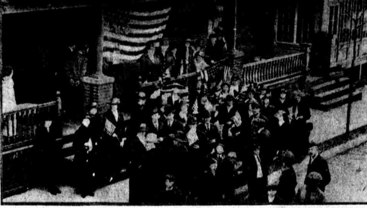
These West Philadelphia tenants waited all day Wednesday for a sheriff's writ server who was attacked by a mob of 1000 persons yesterday. The house with the flag is one from which an aged couple, parents of a wounded war veteran, were ejected