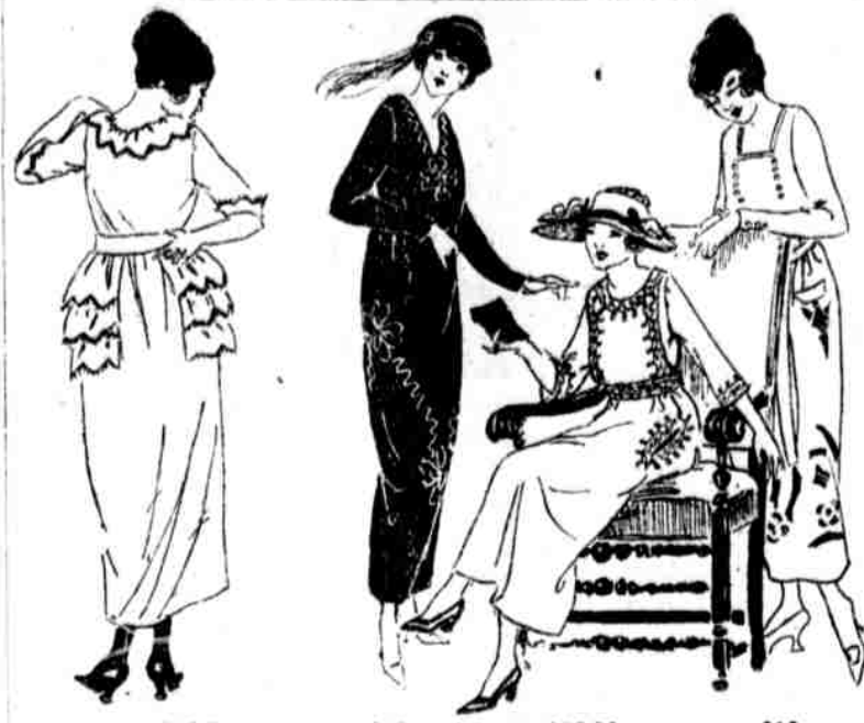
$12.50 $10 $12.50 $10