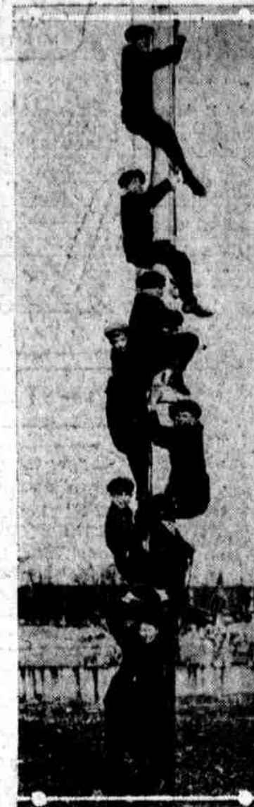
BOYS of the Northwestern section of the city yesterday proved to our photographer that they could climb a flag-pole as well as they could climb trees and were willing to be photographed at Moylan Park