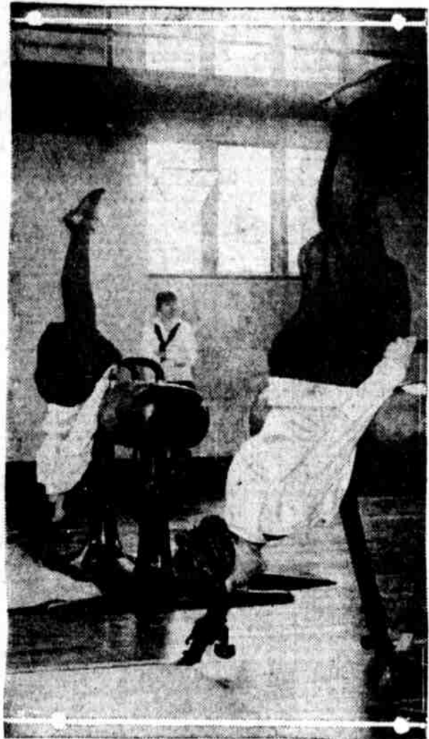
BRYN MAWR STUDENTS do stunts on the gymnasium horses. If you think it's easy—try it.