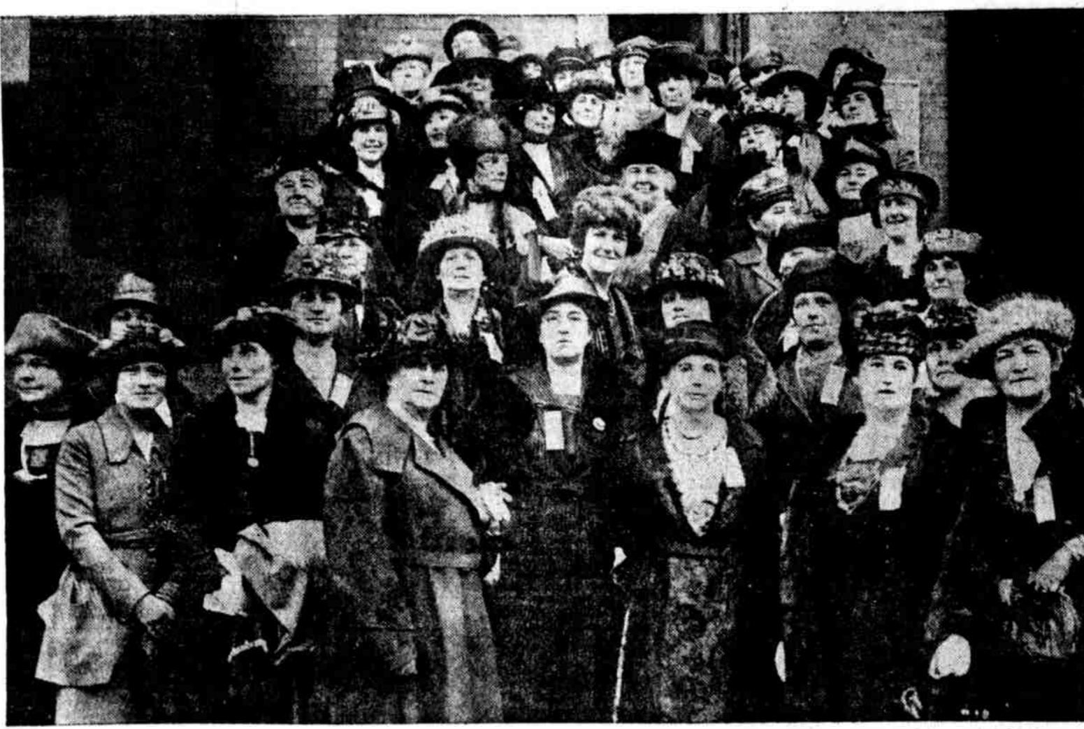
THE FIRST GENERAL MEETING of the Republican women's committee of Pennsylvania is being held at the Bellevue-Stratford today. Prior to the opening of the session a conference was held at their headquarters, 506 South Broad street, where the G. O. P. women were photographed.