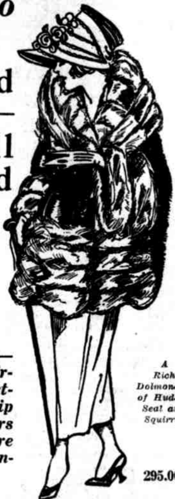
A Rich Dolmanette of Hudson Seal and Squirrel