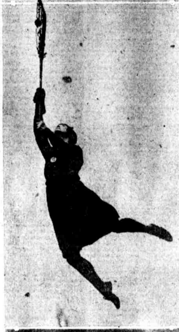
UP AFTER THE BALL in a lacrosse game in London. She got it, too, as the ball can be seen against the racquet.