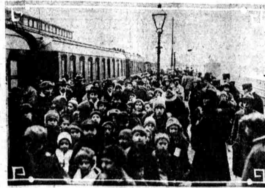
International-Universal Film. GROUP OF AUSTRIAN CHILDREN leaving a station in Vienna for Norway, where they will rest, receive medical treatment and proper feeding, following long war privation.