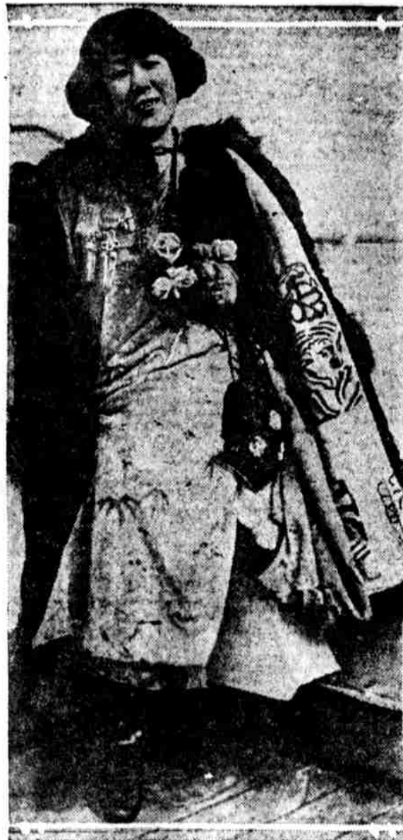
MME. TAMAKI MIURA, a Japanese opera singer of the Chicago Opera Co., has departed for Monte Carlo, where she will sing.