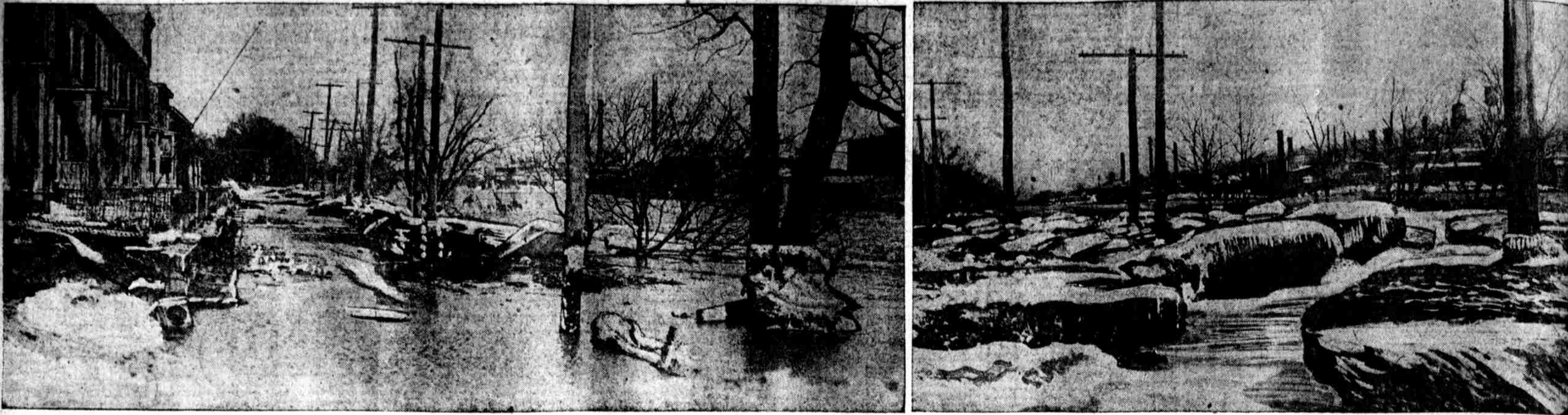
SCORES OF MANAYUNK FAMILIES living along the Schuylkill river found themselves marooned when daylight came this morning, as the water had risen so high that River road, on the bank of the Schuylkill in Manayunk, was covered with about six feet of water and ice. Both photographs are of River road, and they show that a calamity was averted by the fact that the raging river quickly receded. The height that the water and ice reached can be seen in the photographs. It will take days to clear the ice from the portion of the road shown in the etching at the right