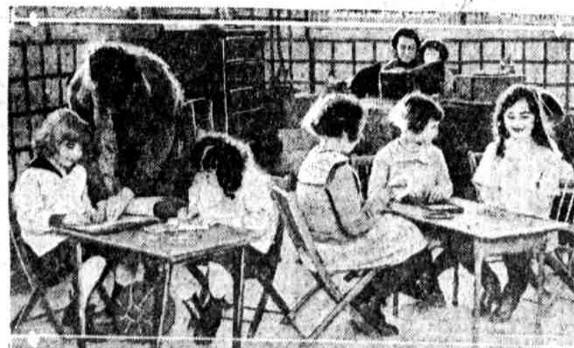
A SCHOOL ROOM on the roof of a New York hotel used by the "kiddies," who are guests.