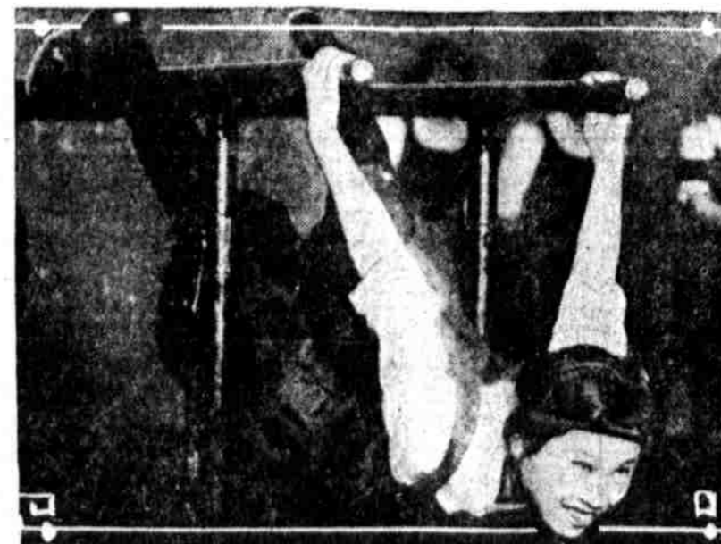
A FAIR STUDENT from the Far East doing gym stunts at the Bryn Mawr College Gymnasium.