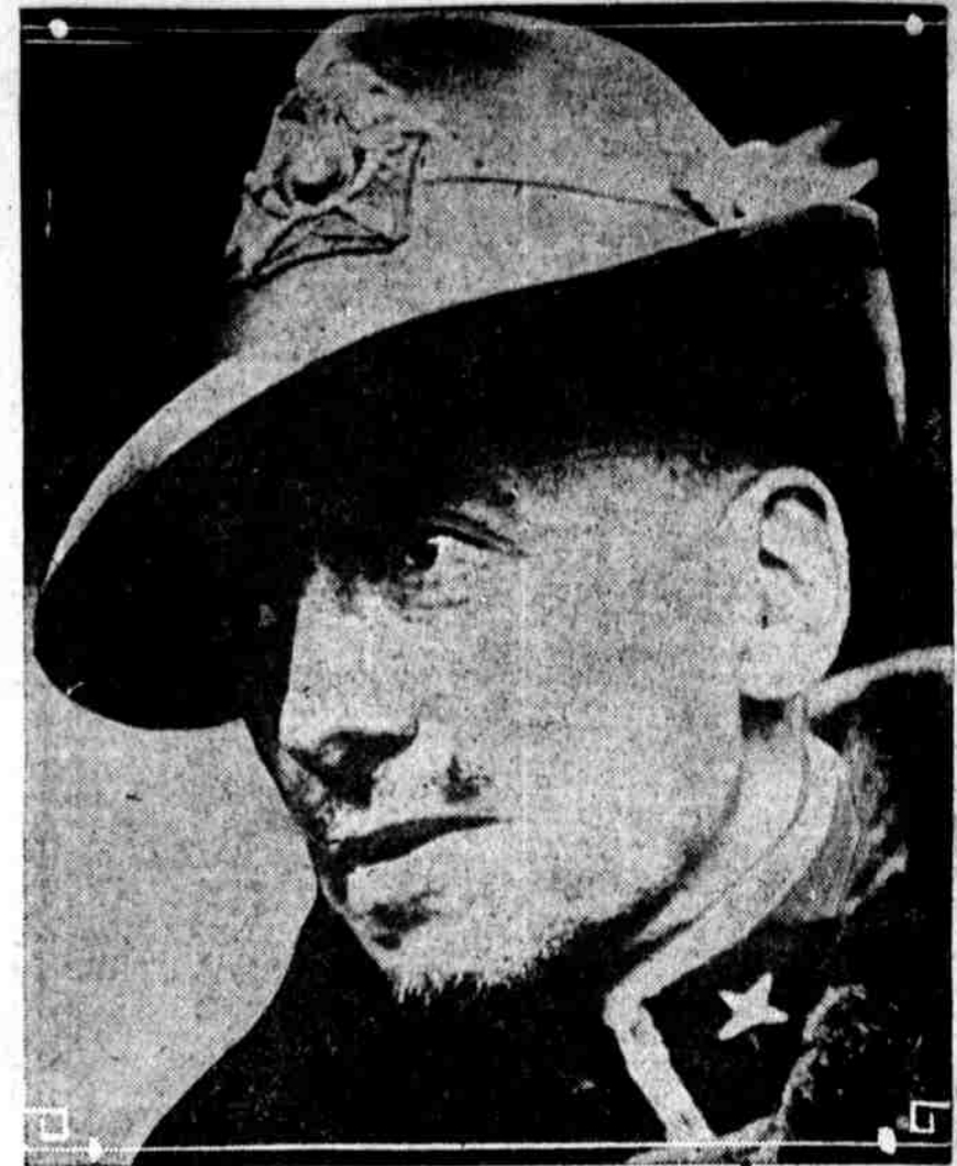
GABRIELE D'ANNUNZIO, the Italian poet-warrior, a central figure in the Fiume dispute. His slogan is "Fiume to Italy."