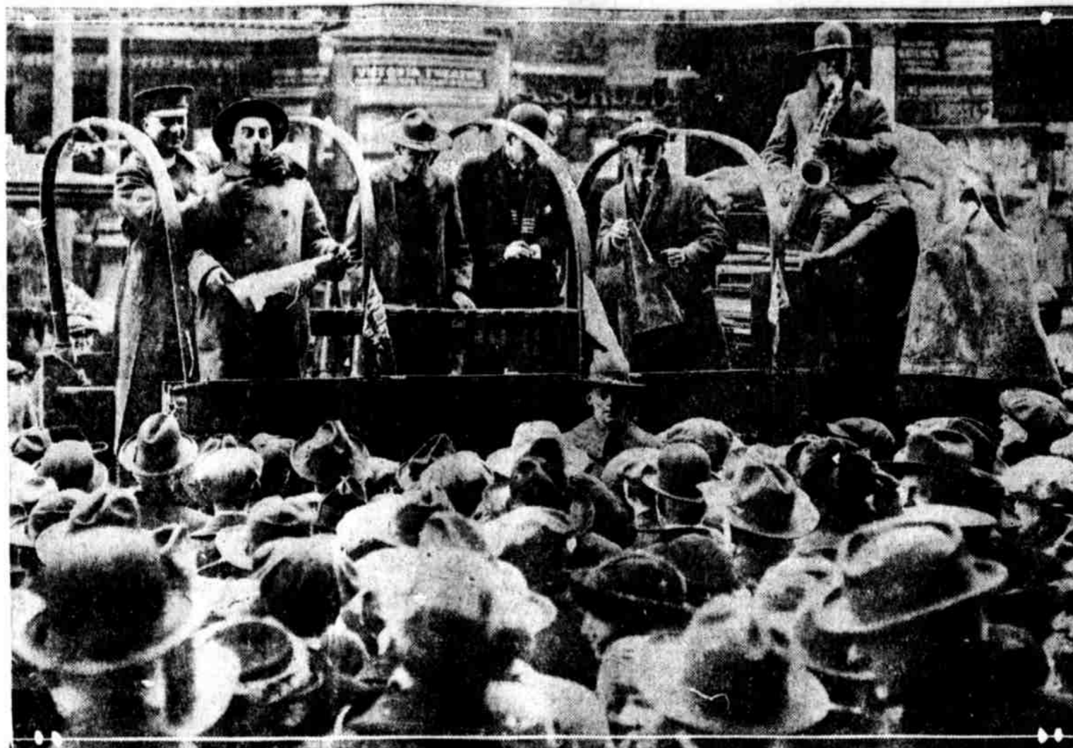
HUNDREDS BEING amused by an army recruiting squad on Market street, near Ninth. The musicians and song leaders kept the crowd intact as a recruiting staff circulated among the spectators urging enlistments.