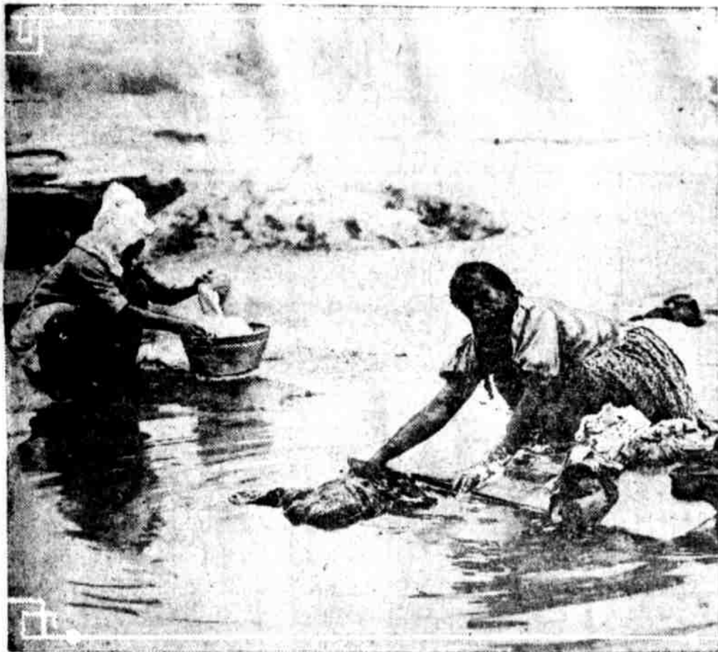
HOT SPRINGS of the South Sea Islands being used as washtubs by the Maori women. No plumbers needed here to assure sufficient hot water.