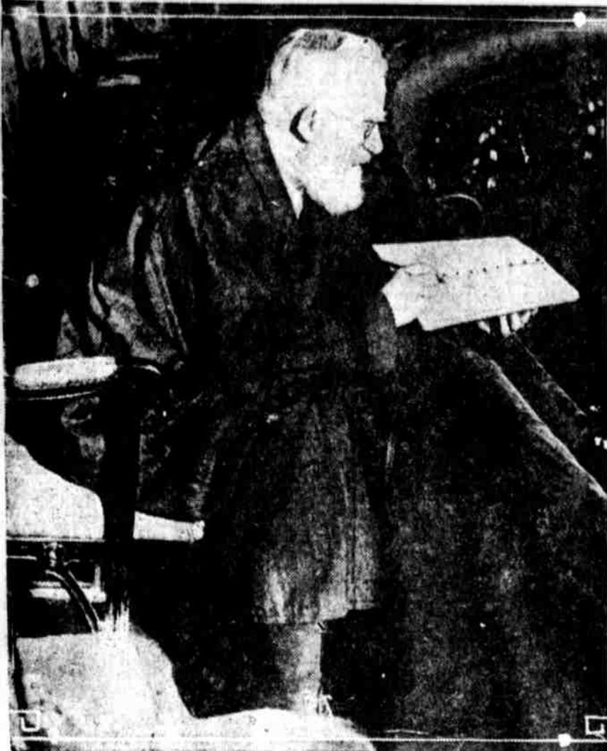
BERNARD SHAW whipping "Pygmalion," which is being revived in England, into shape. Note his working pose in the first row balcony.