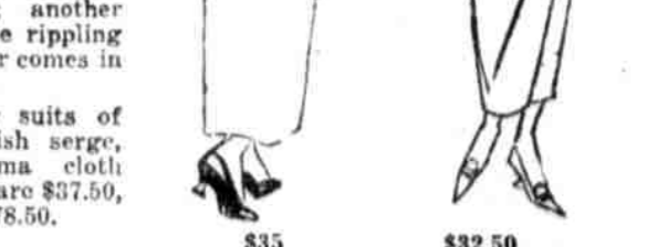
$35 $32.50 (Market)

Other Spring suits of tricotone, mannish serge, silvertone, Hama cloth and wool poplin are $37.50, $39.50, $45 to $78.50.