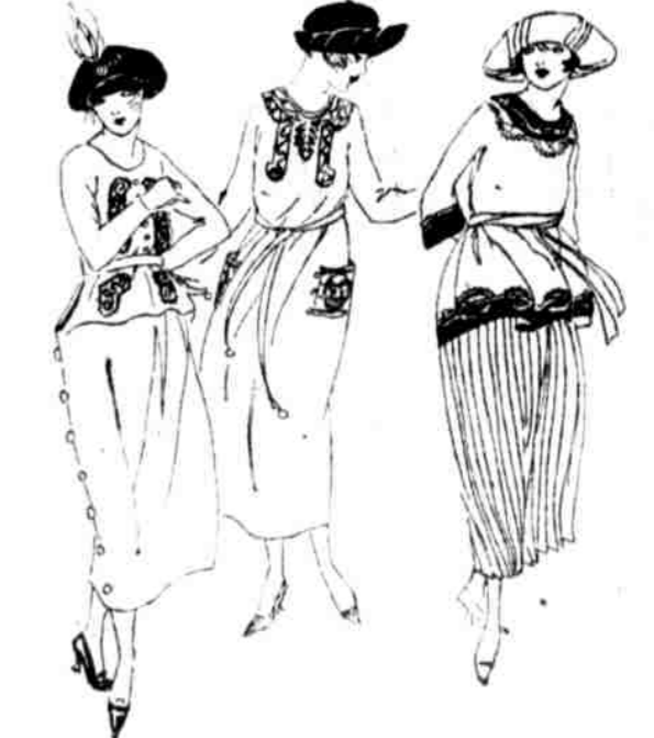
$16.50 $22.50 $25

Swarthmore and bulldog hats of mixed suitings are $2; small boys' hats with roll brims that can be turned up or down are $2.25. Blue serge tams are $2; leather tams, $3.50. (Gallery, Market)