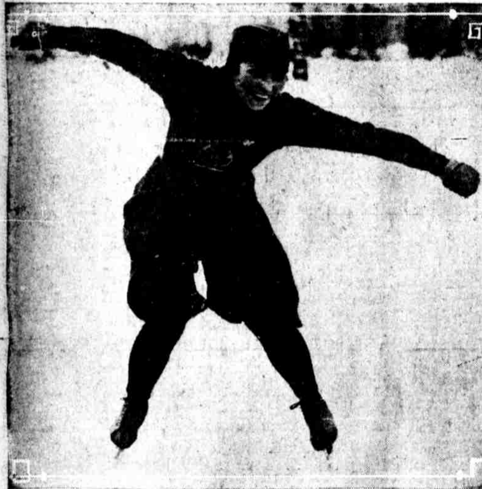
MISS ROSE JOHNSON , Chicago, who has just lowered both the 100 and 200 yard dashes for ice skating at Lake Placid, New York, during the International Championships.