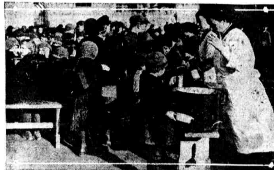
AUSTRIAN CHILDREN receiving food from United States relief agencies at ex-Emperor Karl's palace in Vienna.