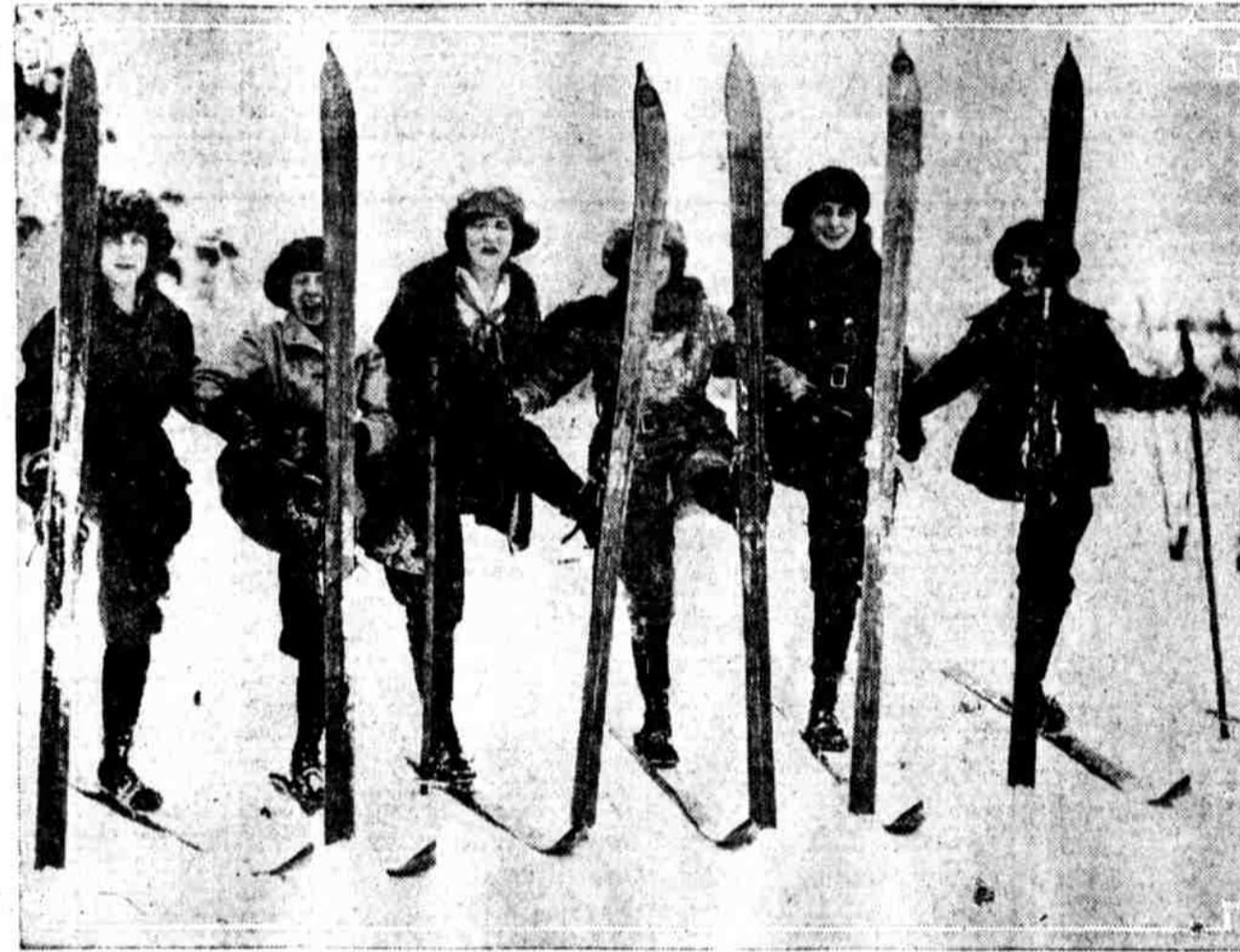
FAIR SKIERS of the Lake Placid Club, N. Y., who took part in the International Championships last week.