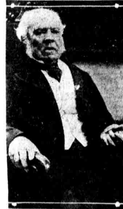
LORD HALSBURY , ninety-four years old, who has just been congratulated on his seventieth year at the London bar.