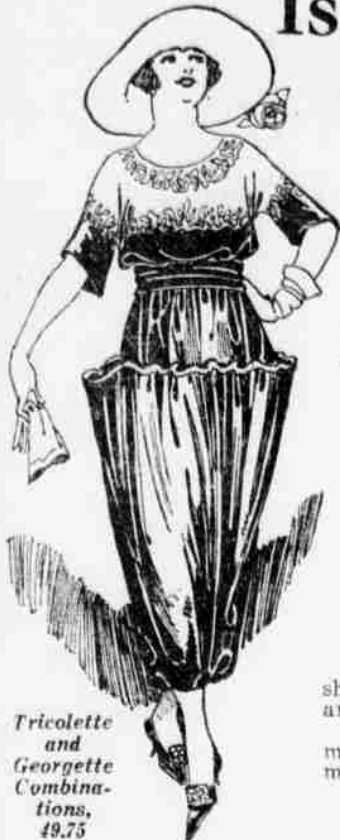
Tricotee and Georgette Combinations, 49.75

In no store will you find such a diversified showing at these popular prices. DAYLIGHT—THIRD FLOOR