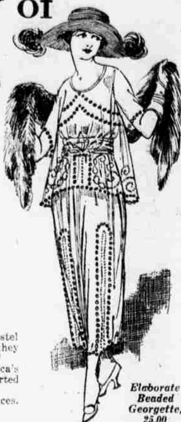
Elaborate Beaded Georgette, 25.00

Visit Our New Men's & Boys' Clothing & Furnishings Store—Tomorrow!!