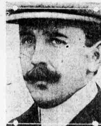
Count Szechenyi, Hungarian minister to the United States, now in Norway, assisting in reorganization of its foreign service.