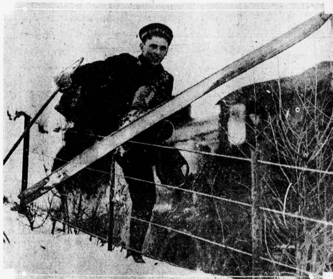
Fences no obstacle for the lover of skiing in Norway.