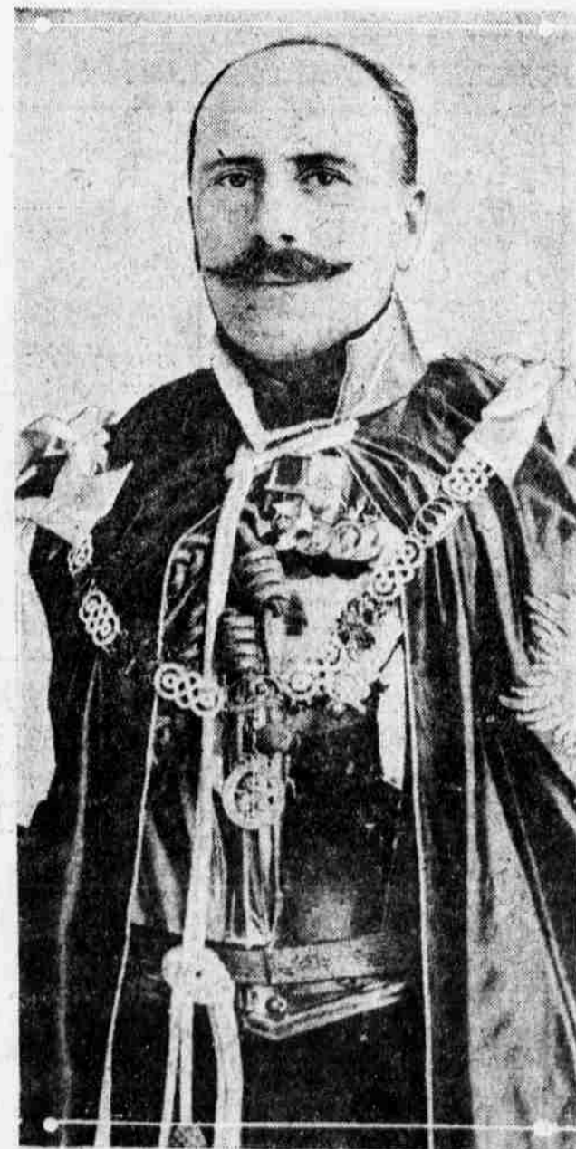
Duke of Athlone, who will soon leave England to assume the office of governor general of Canada.