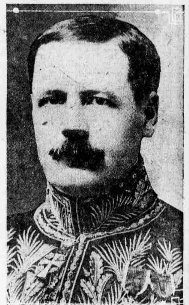
Count Szechenyi, Hungarian minister to the United States, now in Norway, assisting in reorganization of its foreign service.