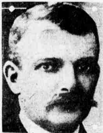
Raoul Peret, elected president of the French Chamber of Deputies.