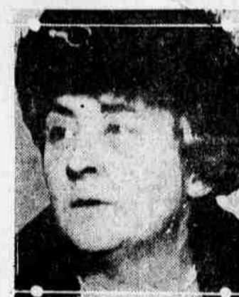
Miss Anne Morgan, daughter of J. Pierpont Morgan, was in consultation yesterday afternoon with officers of the Emergency Aid.