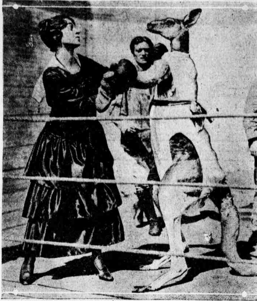
Blocking, footwork and the way to land an uppercut being taught a boxing kangaroo.