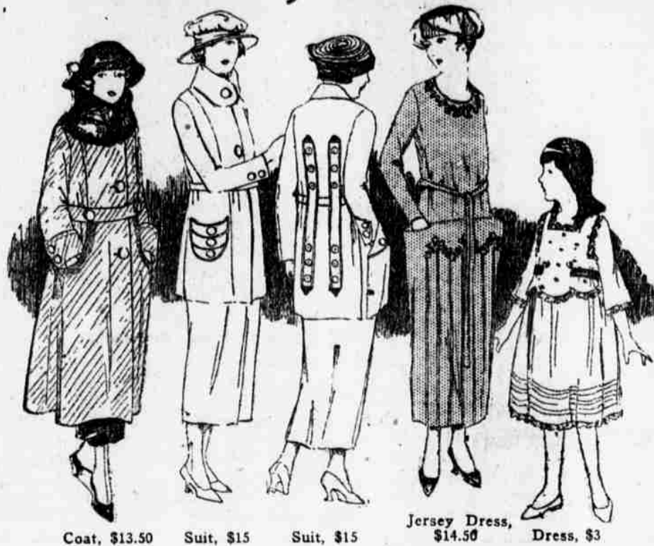
Coat, $13.50 Suit, $15 Suit, $15 Jersey Dress, $14.50 Dress, $3

Dresses, $14.50 Smart Jersey, serge and dressy satin and taffeta Dresses, featuring over-skirt and new drape effects. Navy, tan, brown, king's blue and black. Many cleverly embroidered. Sizes 14 years to 44 bust. Also extra sizes.