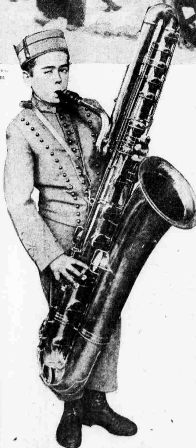
Underwood & Underwood.