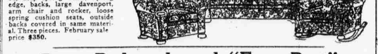
Save $100 on These Suites Luxurious suite as illustrated, deep spring seats, spring edge, backs, large davenport, arm chair and rocker, loose spring cushion seats, outside backs covered in same material. Three pieces. February sale price $350.