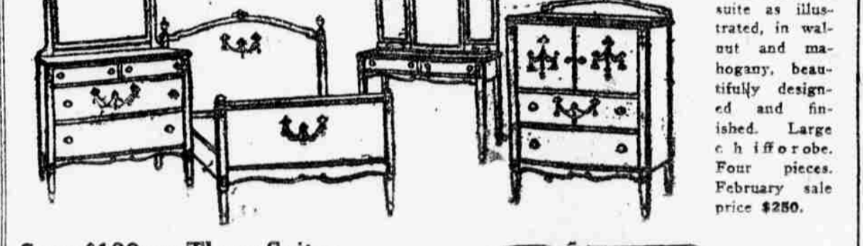
Save $150 on These Suites Heppelwhite suite as illustrated, in walnut and mahogany, beautifully designed and finished. Large chest of drawers. Four pieces. February sale price $250.