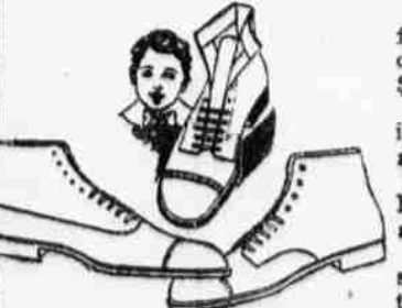
Men's Now $9.85