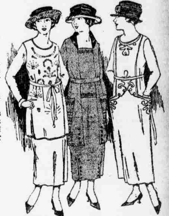
—Gimbels, Subway Store. Jersey Dress, Hand Emb., $19.75. Serge Dress, $14.85. Jersey Dress, $14.85.