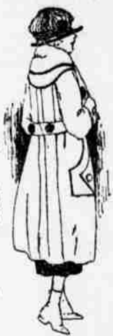
High School Girls' Coat, $15