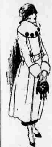
Misses' Coat—Now $15

Four hundred coats to choose from when sale starts tomorrow morning. Coats to fit the girl of six years up to the young miss of twenty. In the Girls' Coats at $15 materials include cheviot-velours, silvertones and heather-tones. Tailored and a few dress models. Half lined or lined throughout. In navy, henna, gray, green, brown, tan and Peking. For ages 6 to 16 years. The Misses' Coats at $15 include those of zibeline, English mixtures and cheviot-velours, pleated loose backs or belted models—some blouse back. Raglan or set-in sleeves. Lovely colors such as horizon blue, navy, Peking, green, brown, reindeer, wine and black. For ages 14 to 20 years. Coats for the little girl, the high school girl or business miss.