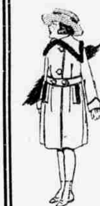
Girls' Coat Now $6.75