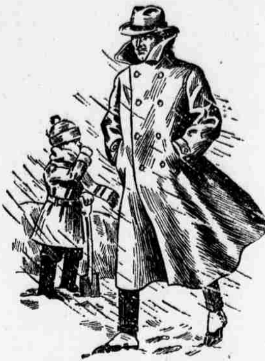
—Gimbels, Second floor.

The rest of the London-made Overcoats, $65. Fur-collared Overcoats, savings a third—$35 to $112. Fur-lined Overcoats, $145 to Northern mink lined, $325. Mackinaws—the real wool comfort coat—fearless of weather. $13.50. Patrick's, Duluth, Mackinaws, $18.50. The Gimbel Store is of right winning the great clothing business of Philadelphia.